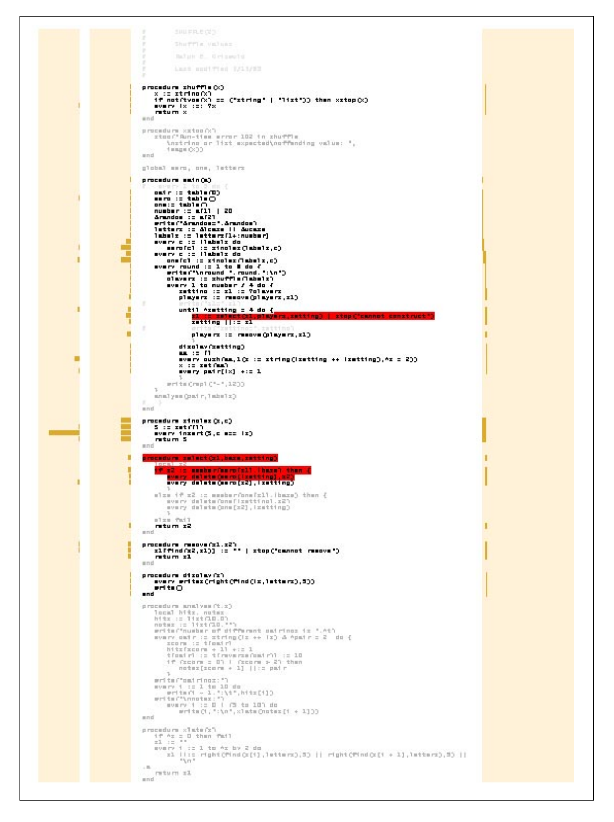
Figure 3: An Intermediate Display Produced by the anim Program