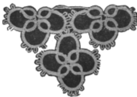
FIG. 1. CORNER DESIGN.

Beginning again, make a motif of four rings and four chains, joining the second p of one ch to first p of third ch and the fourth p of the same ch to fifth p of the first ch in the second motif. The side chains can also be joined to the center chains of the two first motifs to make the work more secure.