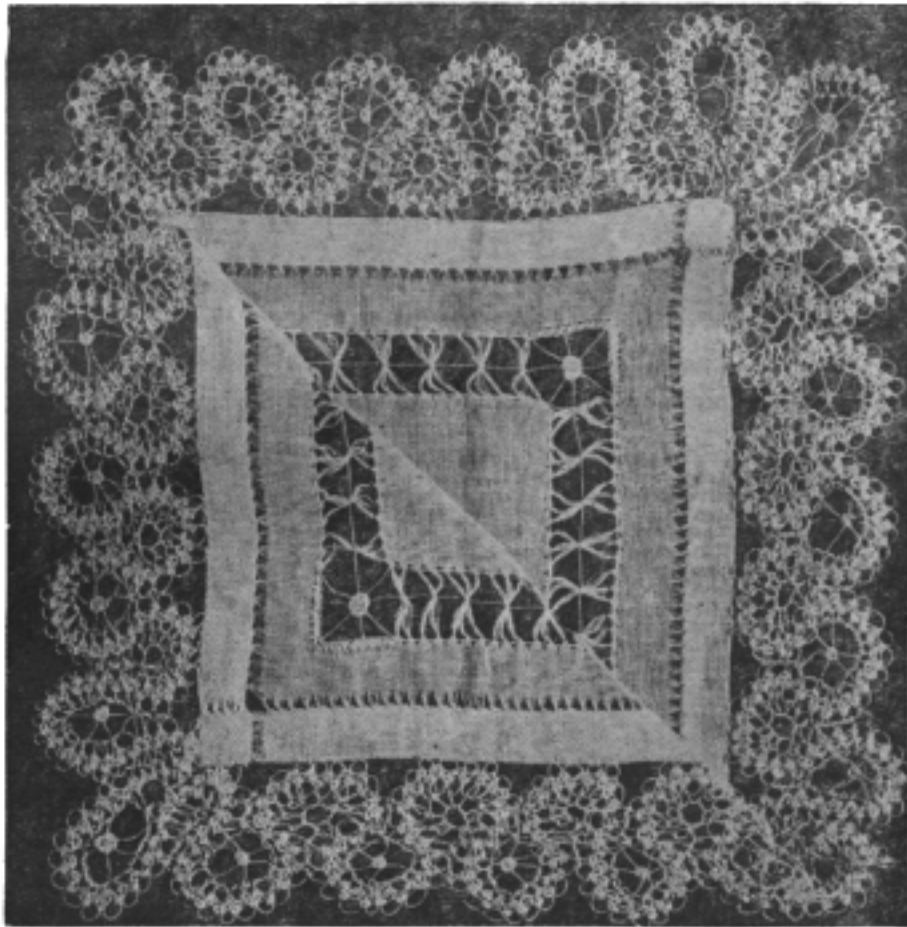
FIGURE 6. MALTESE OR HAIRPIN LACE BORDERED CENTERPIECE.

5th round—Ch 5, 1 d c in first tr c of third leaf, ch 2, 1 d c in third tr c, ch 2, 1 d c in fifth tr c, ch 2, 1 d c in fourth leaf, ch 2, 1 d c in second leaf of next clover, repeat around fastening with sl st in center of ch 5, sl st to center of ch. 6th round—Ch 5, 1 d c under next ch 2, ch 3, 1 d c, repeat around.