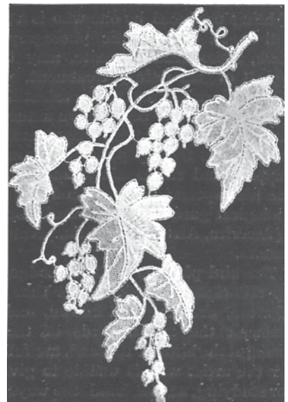
Modern Honiton Spray. Currants.