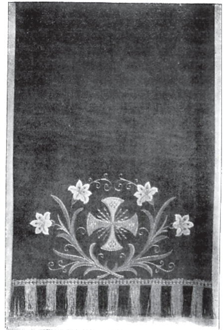
Antependium in Flax and Silk Cloth. (Messrs. J. Harris & Sons.)