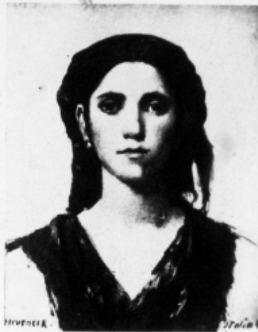
ITALIAN HEAD, BY F. DUVENECK CINCINNATI, OHIO