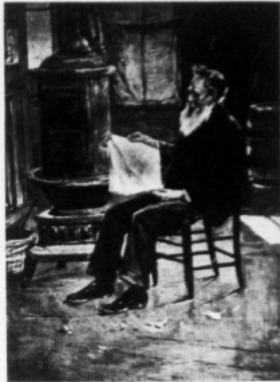
WAITING FOR A CUSTOMER, BY WM. FORSYTH INDIANAPOLIS, INDIANA

Other landscapes strong in local qualities are two water colors by P. Bradley of Cleveland, "July Morning after a Rain," and a crisp,