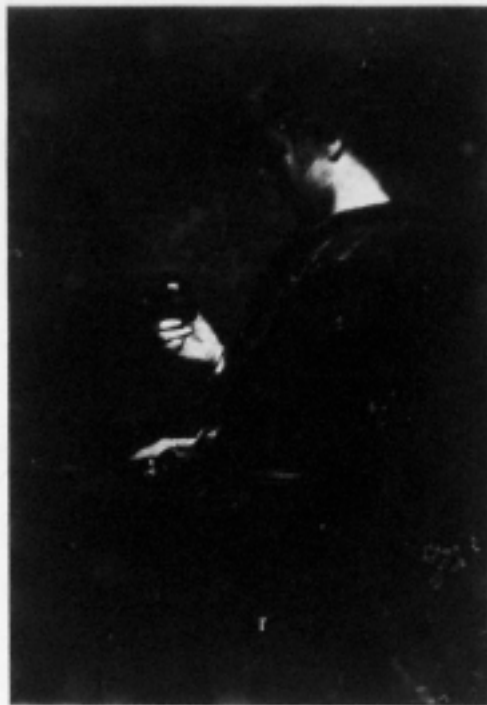
A CLOISONNE JAR, BY MISS C. D. WADE CHICAGO, ILL.

It will be seen that not only are the cities of the circuit repre-