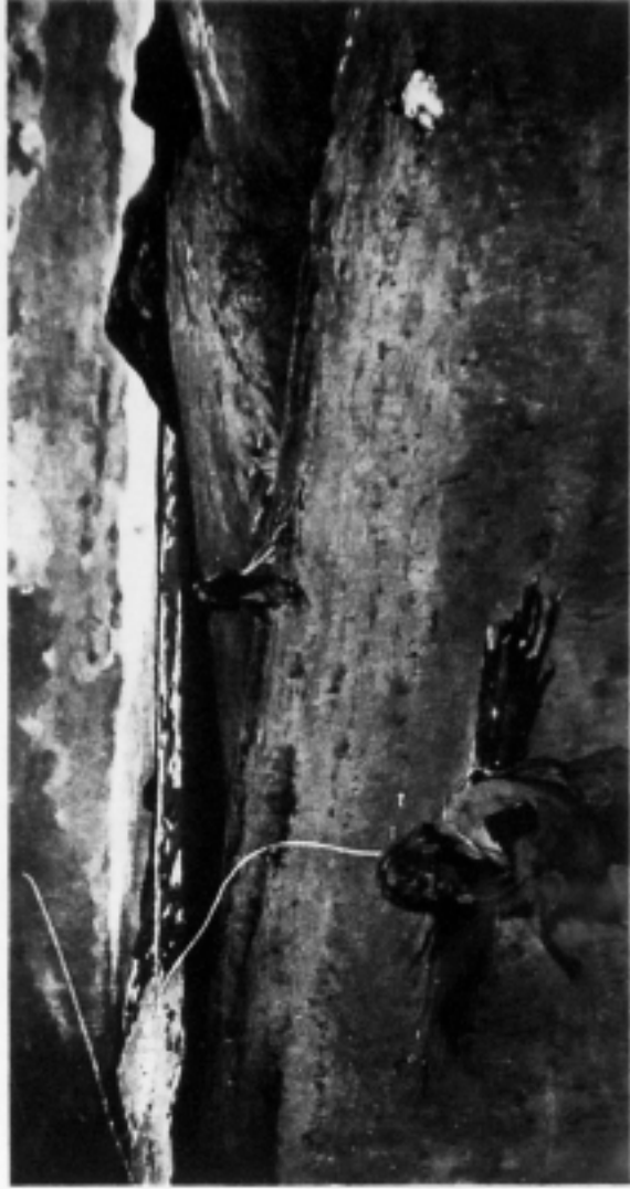
TOWERS OF THE PLAINS, BY B. F. FARNEY CONTINUED, 1920