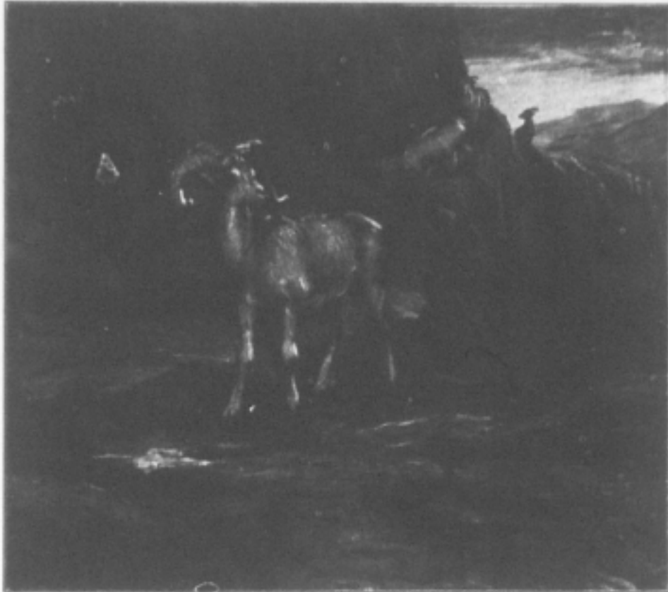
ROCKY MOUNTAIN SHEEP By A. Phimister Proctor

I spoke last month of F. Luis Mora's work. The mural painting which adorns the public library in Lynn, Massachusetts, shows the ambitious manner in which this artist carries out his inventions. It represents "The Awakening of Ignorance," and is a well-thought-out