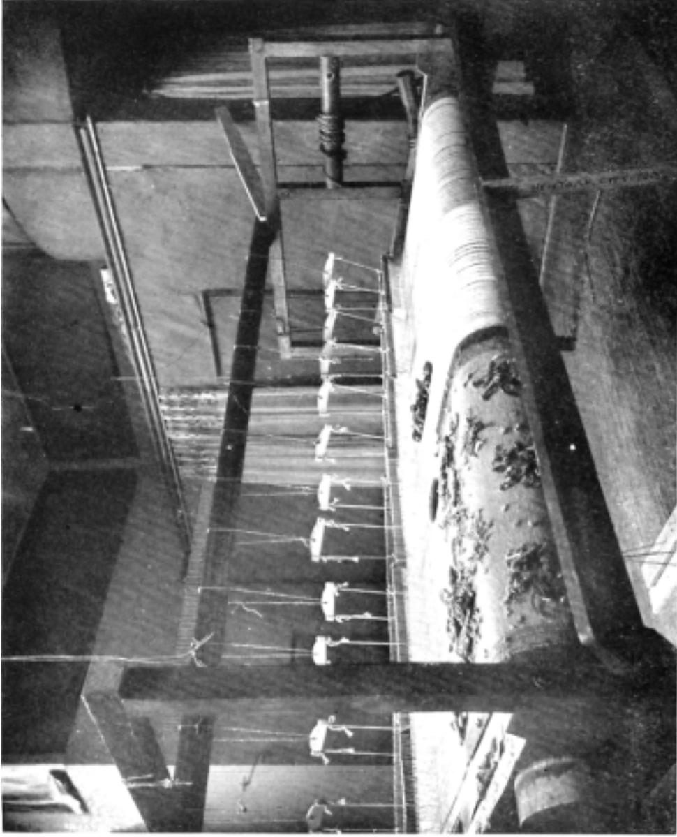
A LOW WARP LOOM IN THE WORKROOM WHERE THE HERTER TAPESTRIES ARE WOVEN.