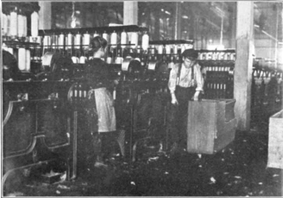
No. 3.—CATAWBA COTTON MILL, NEWTON, N. C. Of forty employees ten were not larger than these. The girl is spinning, the boy is a doffer.