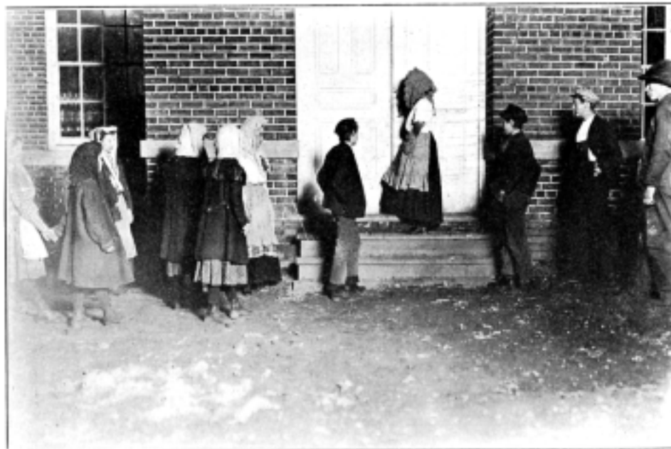
No. 14.—ANOTHER NIGHT SHIFT.

POSTSCRIPT.—Since the above was written, the North Carolina House of Representatives has passed a bill, which is expected to pass the Senate, raising the age-limit from fourteen to fifteen for girls only, at night work, cutting down the hours from 66 a week to 64, and making this apply to all minors and women, forbidding "helpers" in the mill under thirteen years of age, and providing for some degree of factory inspection. But as this amendment goes into effect January 1, 1910, the conditions depicted in these pages may be expected to prevail during 1909.