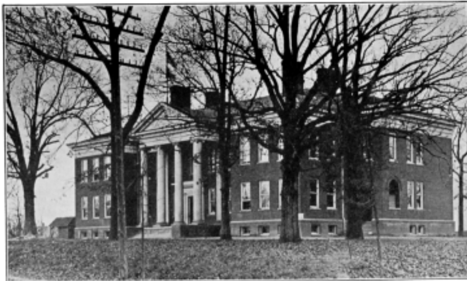
No. 21.—WHERE OTHER CHILDREN GO TO SCHOOL AT LANCASTER, S. C. This is a public school.