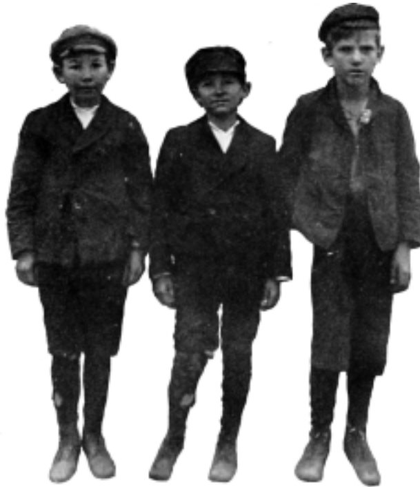
No. 12.—SCOTLAND MILLS, LAURINBURG, N. C. Tallest lad about fourteen years old, has worked eight years in mill, six years at night. The next in height has worked there three years.