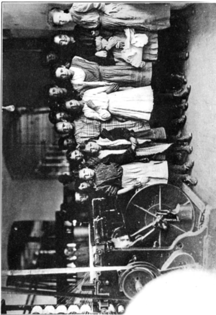
No. 16.—NEWBERRY MILLS, S. C.

Noon hour. All are employees. The unguarded wheel and belt at the left are sinister neighbors for little girls' arms, skirts and braids. There was no factory inspection in South Carolina.