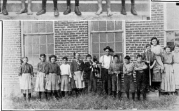
No. 9. WAMPUM MANUFACTURING CO. LINCOLNTON, N. C. Photograph taken at noon hour. Investigator not allowed to take pictures inside the mill.

Closing after twelve-day. One of smallest boys he had been the mill two three years. is now two years old.