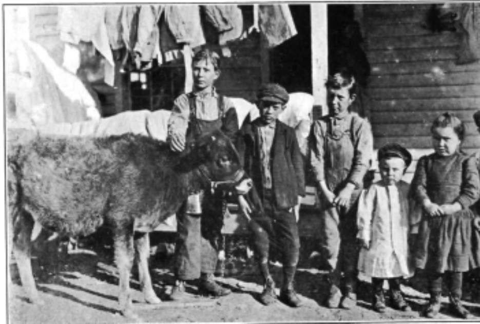
No. 26.—“BACK TO THE FARM.”

A group of employees at the Clinton, S. C. Mill, going home from work after dark. The photograph was taken by flashlight, as the superintendent would not allow pictures to be taken in the mill. From this it appears that even where there is no night work, the eleven-hour day requires children to go to work while it is yet dark and to work till after nightfall.