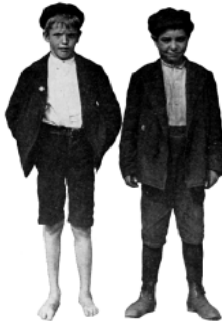
No. 11.—GASTONIA, N. C. Boy on right of picture is ten years old. Has worked three years in the mill, though in school part of the time. Boy on left said he was twelve years old. Has worked in the mill two years and at night nine months. Work below the age of twelve years in factories, even as apprentices, is illegal. Work at night is illegal before the fourteenth birthday.