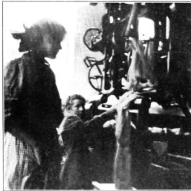
No. 24.—NOT A VIOLATION OF THE SOUTH CAROLINA LAW.

P. S.—Since the above was written, the South Carolina Legislature has passed a law providing for factory inspection. The substance of this article, published in "Charities," with the photographs, had something to do with the result in both the Carolinas.