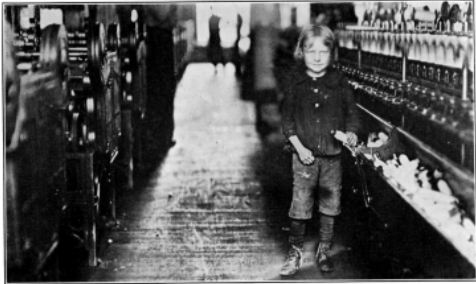
No. 10.—DANIEL MANUFACTURING COMPANY, LINCOLNTON, N. C. Six years old. Stays all day in the mill where his mother and sister work. Is beginning to "help" a little and will probably soon be regularly at work, though his name may not appear on the payroll.