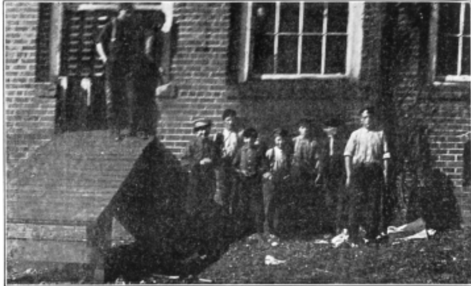
No. 1.—NEW YEAR'S DAY AT ATHERTON MILLS, CHARLOTTE, N. C. Mr. Hine was refused permission to photograph children in the mill. These doffer boys were photographed at the noon hour.