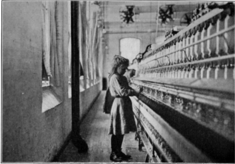
No. 22.—LANCASTER, S. C. Spinner. A type of many in the mill. If they are children of widows or of disabled fathers, they may legally work until nine p. m., while other children must legally quit at eight p. m.