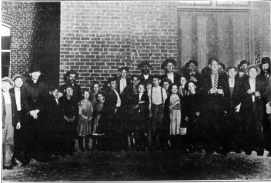
No. 25.—GOING HOME AFTER DARK.

A group of employees at the Clinton, S. C. Mill, going home from work after dark. The photograph was taken by flashlight, as the superintendent would not allow pictures to be taken in the mill. From this it appears that even where there is no night work, the eleven-hour day requires children to go to work while it is yet dark and to work till after nightfall.