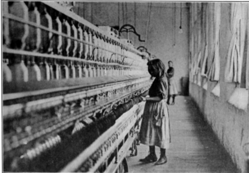
No. 23.—LANCASTER, S. C. Has worked six months, is forty-eight inches tall. One of many small children at work in Lancaster Cotton Mills. Children may legally work at any age in June, July and August if they have attended school four months that year and can read and write.