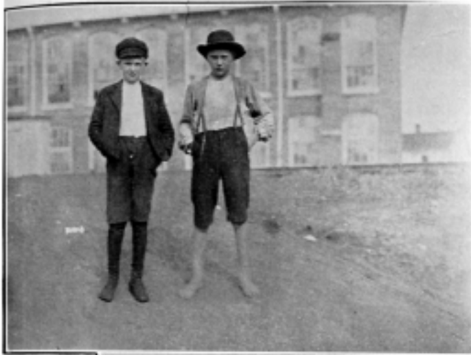
No. 17 WYLIE MILL, CHESTER, S. C.

The barefoot lad, now thirteen years old, has worked since he was six. He has lost part of a finger in machinery. The other boy, now eleven, has worked a year.