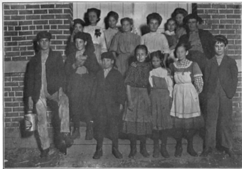
No. 5.—COTTON MILL, WHITNEL, N. C.

On the night shift, waiting for the whistle. Smallest boy and girl about fifty inches tall. Smallest girl had been in mill two years, six months at night. One medium sized boy had doffed four years; partly at night, and gets sixty cents a night. Work after eight p. m. is illegal for children under fourteen years.