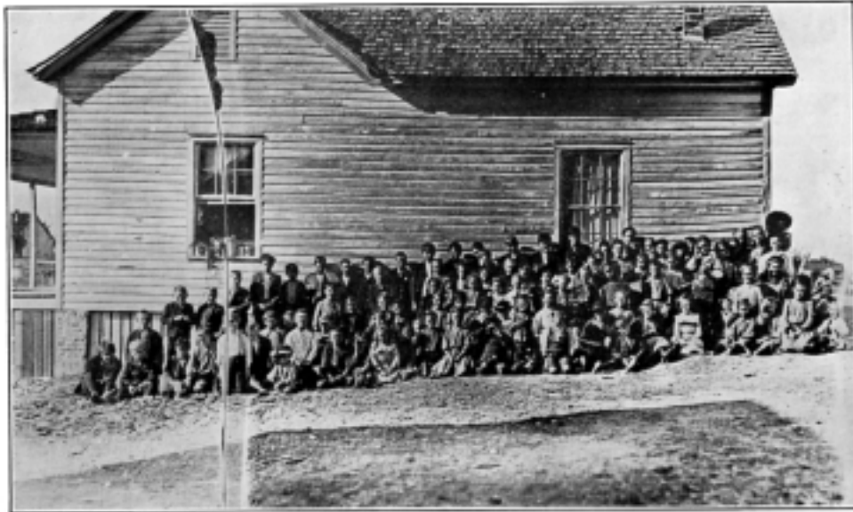
No. 20.—WHERE MILL CHILDREN GO TO SCHOOL AT LANCASTER, S. C. Enrollment 163, attendance usually about 100. There are more than 1,000 operatives in the mill. The mill is geographically part of Lancaster, but on account of the taxes has been kept just out of the corporate limits.