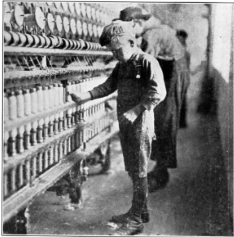
DOFFER OF THE MELLVILLE MANUFACTURING COMPANY, CHERRYVILLE, N. C. Says he has worked two years. One of the many below the legal age.