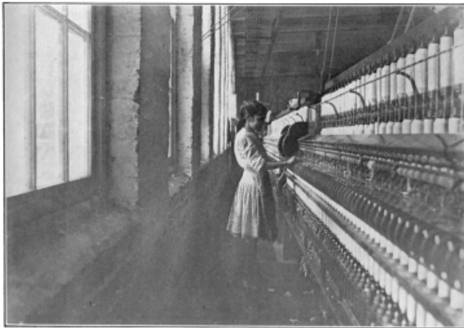
No. 6.—COTTON MILL, WHITNEL, N. C.

On the night shift, waiting for the whistle. Smallest boy and girl about fifty inches tall. Smallest girl had been in mill two years, six months at night. One medium sized boy had doffed four years; partly at night, and gets sixty cents a night. Work after eight p. m. is illegal for children under fourteen years.