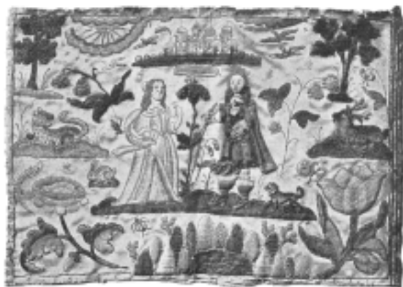
NO. III.—CHARLES I.

No. v., another example of stump-work of the Charles I. period, in lower relief than the other two, is a spirited representation of the Judgement of Solomon. The figure on the right (who, by the way, is in the costume of a Roman soldier, with which he