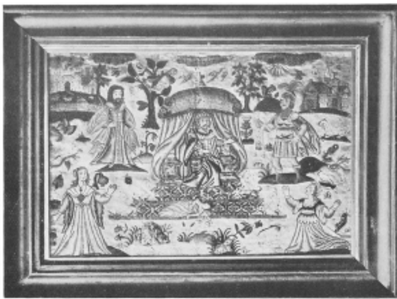
NO. V.—CHARLES I.