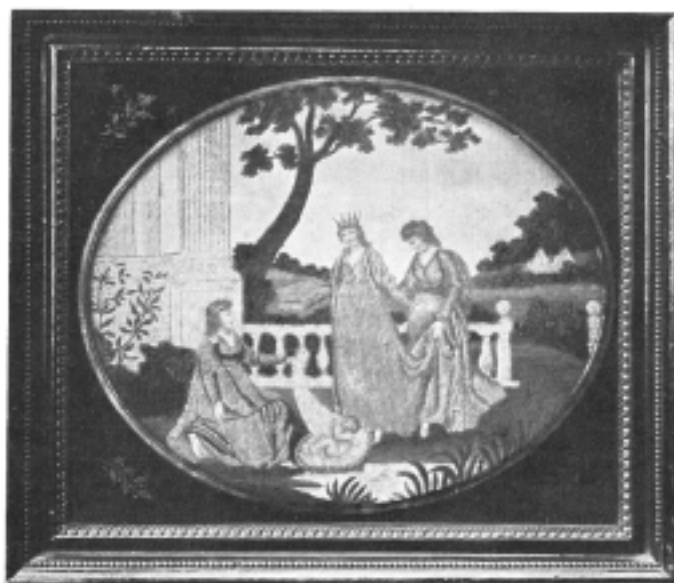
NO. IV.—QUEEN ANNE