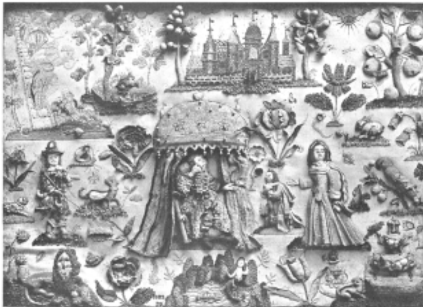
NO. II.—CHARLES I.

nation, unknown in modern botany, where various wild and tame beasts and birds, and even fish, disport themselves under a beautiful noonday sun, worked in gold thread. Observe the king of beasts peacefully slumbering in one corner, and