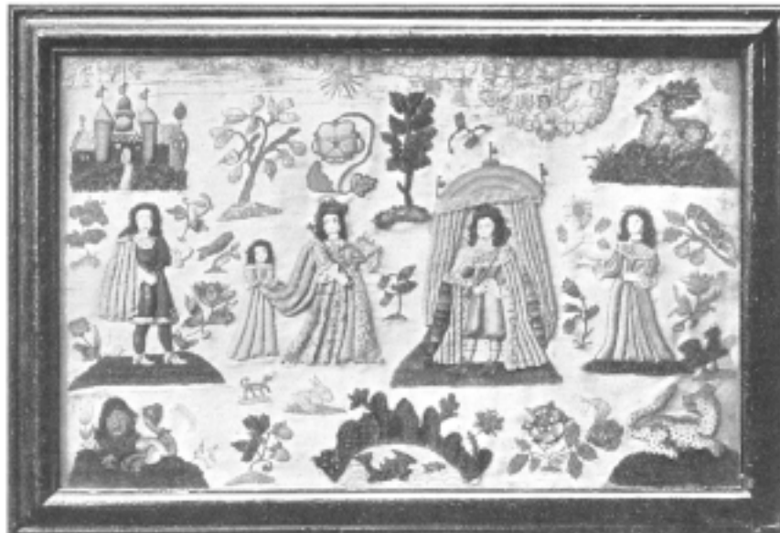
No. VI.—CHARLES II.

There is something intensely fascinating about these old-world embroideries, something which has nothing to do with their intrinsic beauty, or with their age. It is the sense of the human care and labour which have been spent upon them, the consciousness that they are the work of human fingers, and have been the objects of thoughts and intents and aspirations, of heartbreakings and disappointments, of recoveries and the joyousness of success, of the gloriousness of work well done and completed. All the fair devices and designs that ever were fancied cannot be expressed and rendered by the machine with anything like the beauty of those which are hand-sewn. As the supreme worth of the diamond lies in the fact that it took infinite pains and time to find it, then to cut it and set it, so the true delight and supreme worth of needlework lies in the magnetism of those dead hands that worked it, of the individuality that planned it and set its seal indelibly upon it for ever.