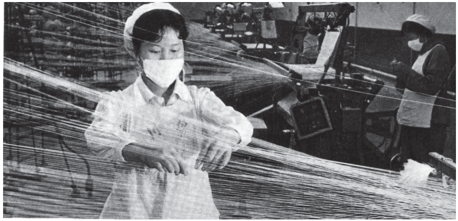
In the beaming shop of the Szechuan No. 1 Cotton Textile Mill