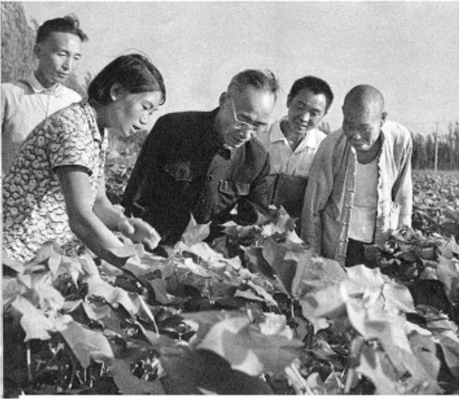
Model cotton growers and experts visit Chia's group to see how the plants are doing in their field.