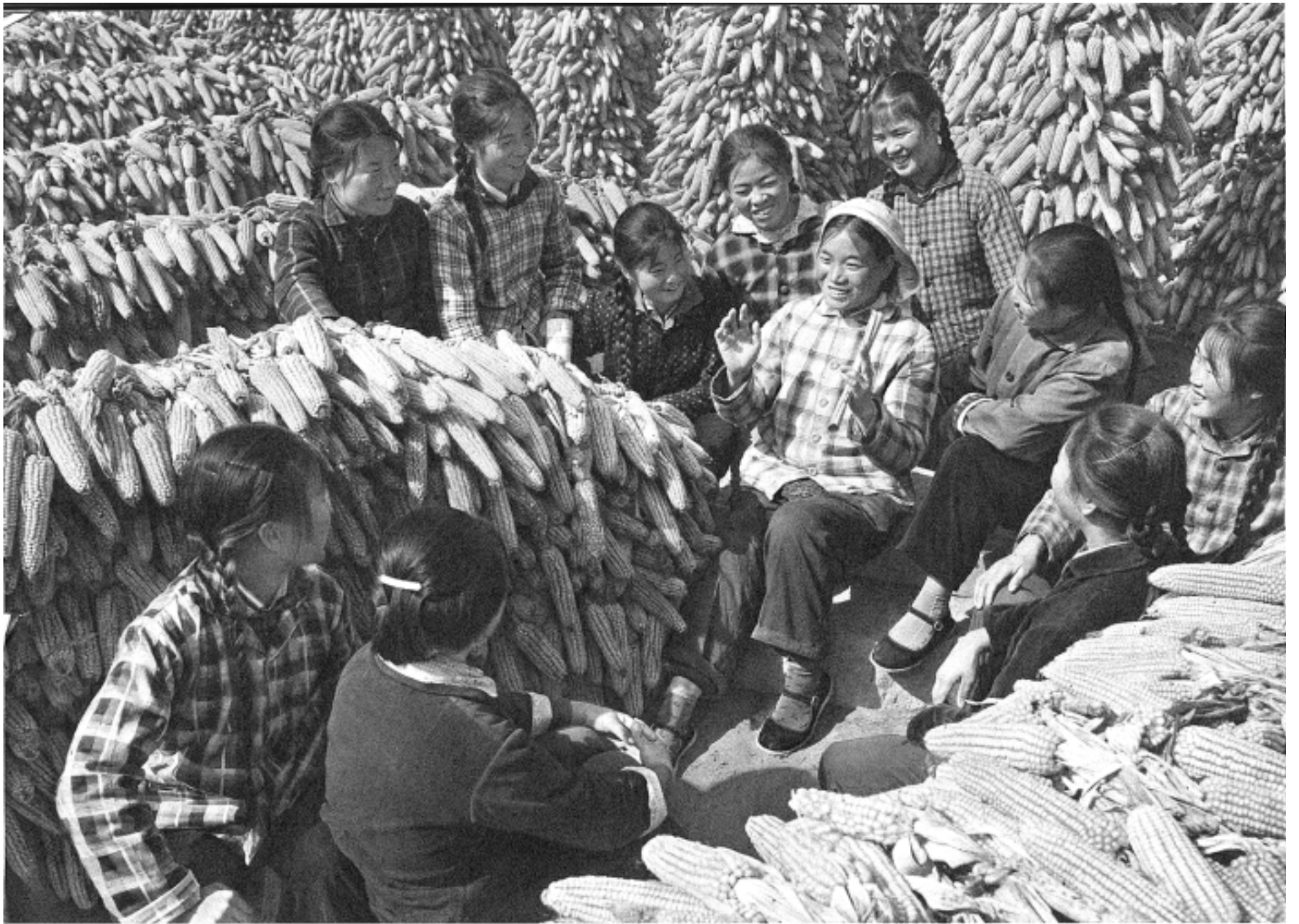
Group members summing up experience.