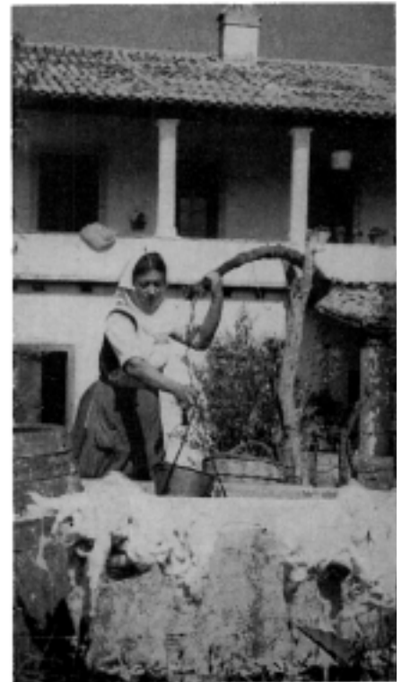
Woman washing wool at a Village Well.