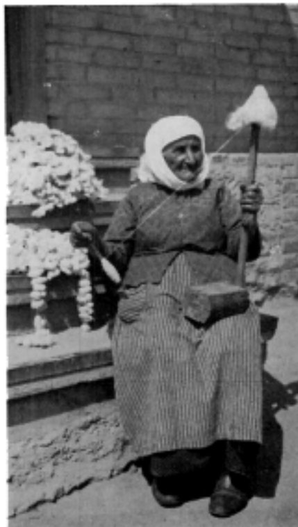
Silk is spun by most primitive methods.

As a rule the chief products of the homeloom are the household linens and the family wearing apparel, and by far its most important use in the eyes of the family is for the preparation of the daughter's dowry in which all the skill and love of creation is used by both the mother and her daughters to make quantities of beautiful things that will last out the daughter's lifetime and will often be handed down to the next generation. But the peasant loom also has its market. The North sends its beautiful rugs, its woolen bags and sport materials (samroskouti) to the market, while the silk producing areas send their beautiful "coucoularico" (material woven from silk thread spun by