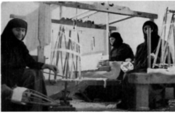
Nuns in Hydra, twisting silk.