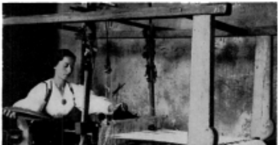
Working at the loom in Arachova.

hand from the waste products of the cocoon—commonly known in America as raw silk), their many colored tafetas, their half silk, half cotton materials used for men's shirting and women's dresses. The islands send their gaily colored cottons either in plain weaving or with the inlay embroidery used for women's garments, table linen, couch covers, curtains and draperies. Rhodes, Macedonia, Chios and others send their beautiful Persian carpets.