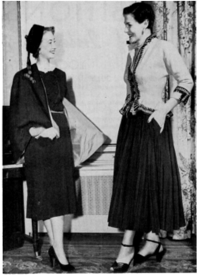
Wool cape costume, Cretan inspired—Evzone type embroidered silk jacket, cotton skirt.

donian costume called Gida, after the historically important northern village. Its most characteristic feature is the helmet-like headdress, derived from the helmet of Alexander the Great, which can be worn only by married women. Legend says that Alexander permitted the Macedonian women to wear the helmet as a tribute to their bravery and reward for their important role in battles.