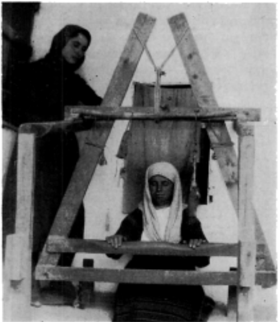
Primitive looms, made by nomads.