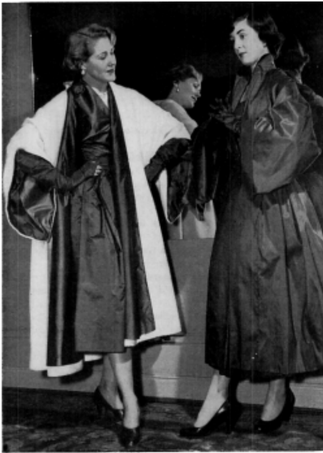
White goat's wool coat, inspired by shepherds of Pogonia; taffeta coat, Cretan style.