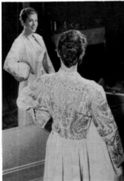
Evening coat modeled after native Ipirus costume, natural raw handwoven silk, embroidered in gold braid.