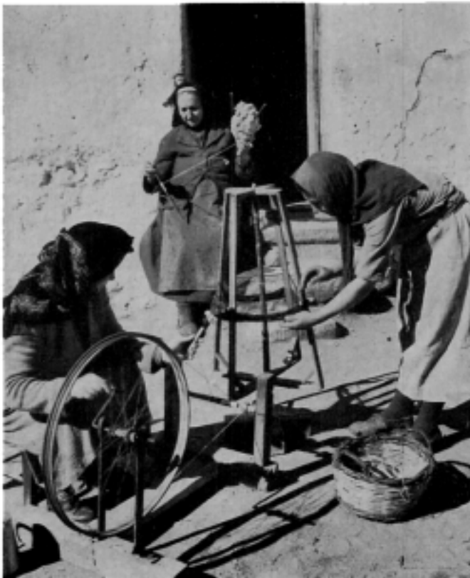
Spinning is a family occupation in Country homes in Attika.

Aside from the carpet looms we find three main types of looms in Greece—the very primitive loom made by the nomad women themselves which is very low and small and easy to dismantle and tie on to the back of a pack mule, its treadles hanging into a hole in the ground dug for that purpose; the ordinary peasant loom in which the shuttle