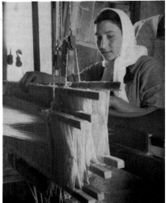
Peasant girls in Attika weave at home on looms of this type.