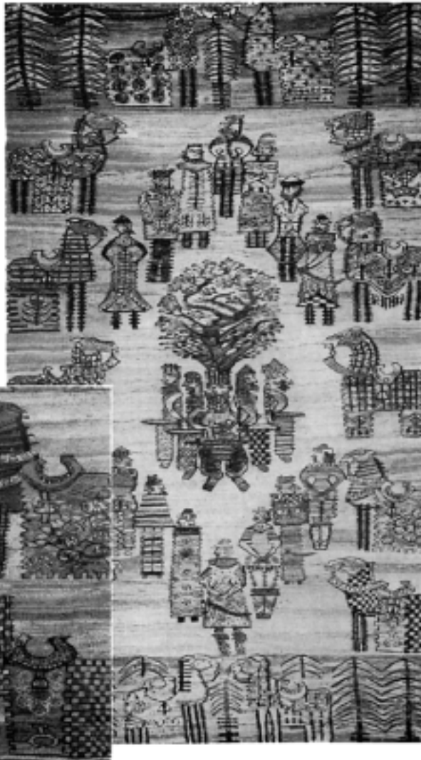
"The Council of Chieftains," wall tapestry by the Galkowskis, wool on linen warp. Below—detail from tapestry.

The creativeness of the artist does not depend of course