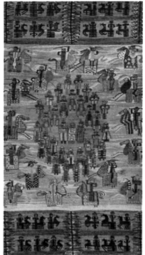
"Tribal Council," another tapestry by the Galkowskis, using characteristic design.