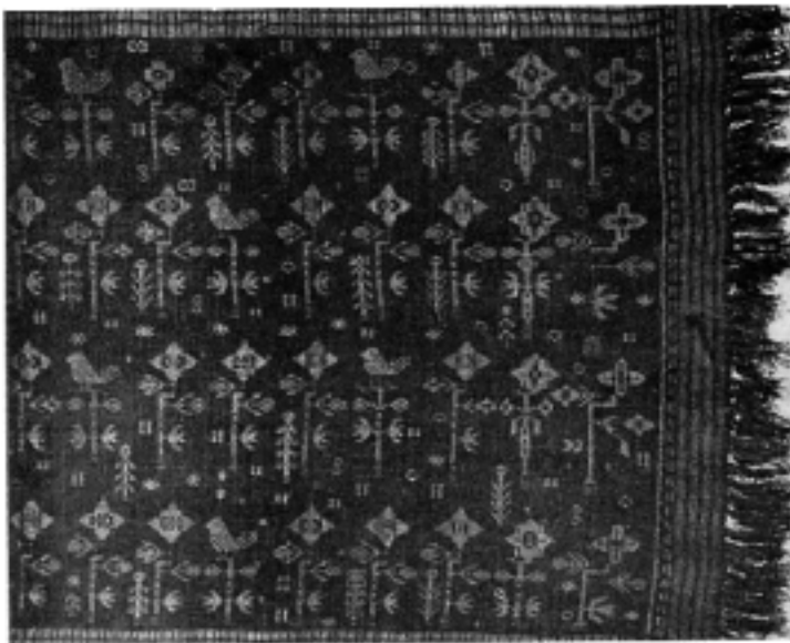
Reversible rugs from the Bialystok peasant looms, showing use of bird and animal forms in design.