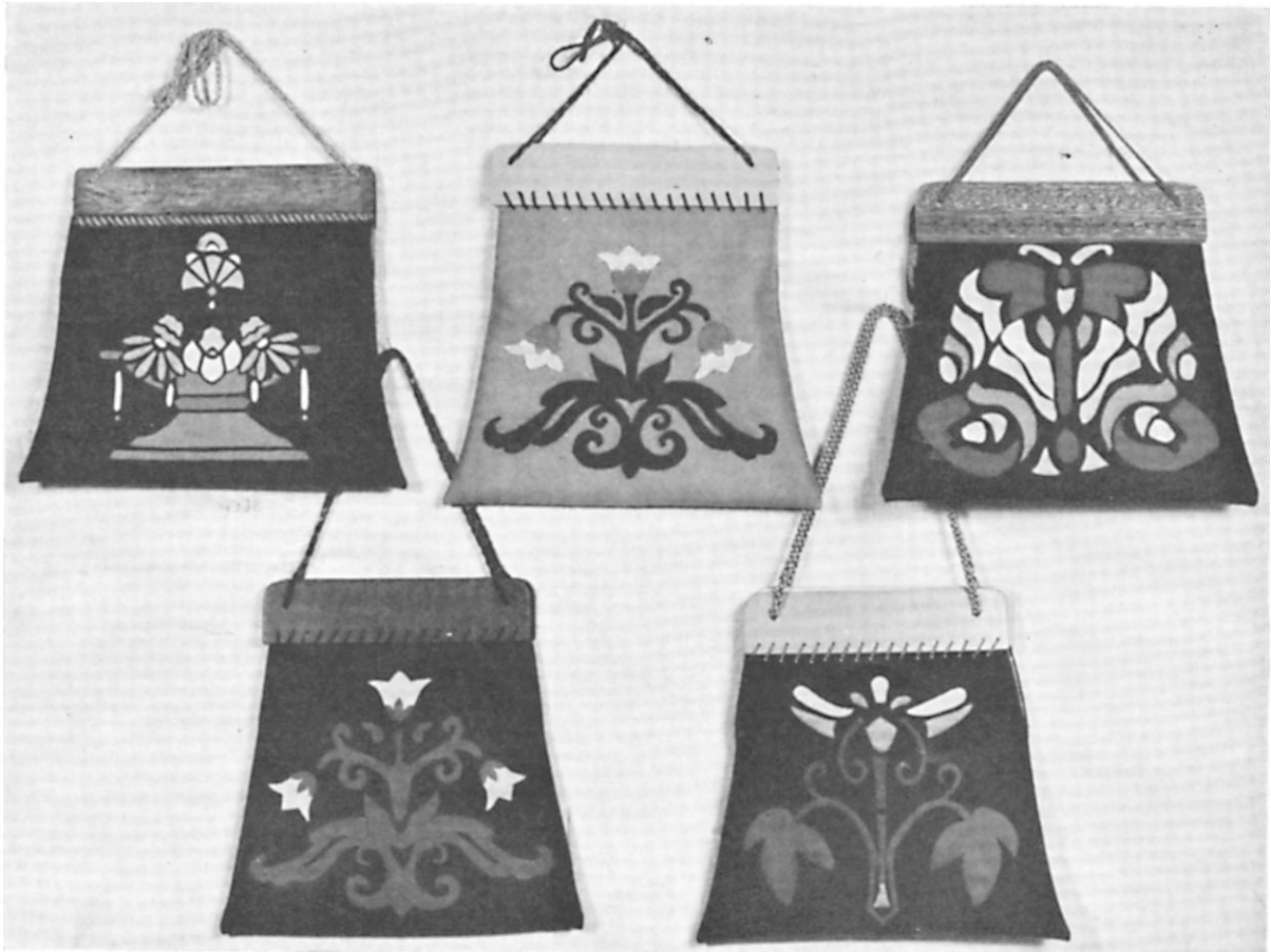
A Group of Utility Bags

For the most part, the linings were of moiré,