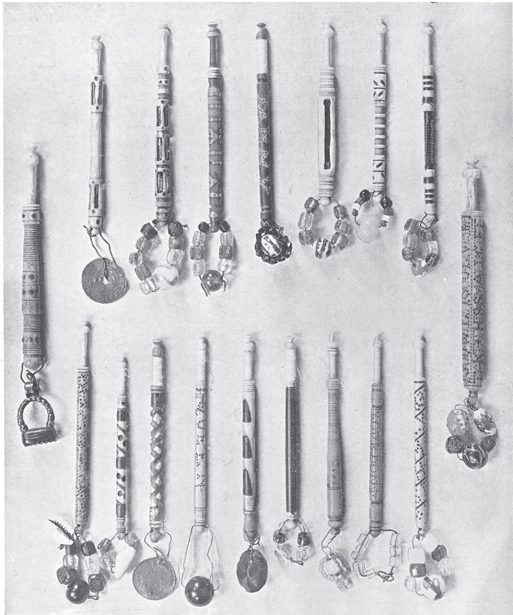
NO. I.—ENGLISH LACE BOBBINS MADE OF BONE

Conspicuous among bobbins of all nationalities are those which were used by the lace-makers of the Midland and Home Counties in the palmy days of the British lace industry, chiefly by reason of their