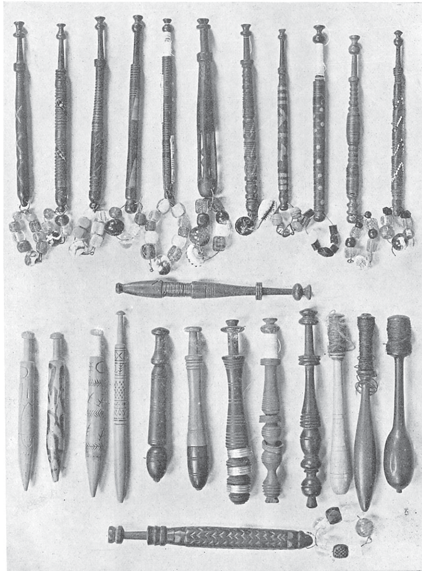
NO. II.—ENGLISH LACE BOBBINS MADE OF WOOD

The bobbins used in Devonshire, of which four