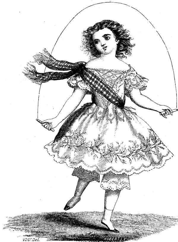
FIGURE 5.—CHILD'S DRESS.

THE CHILD'S DRESS is made of merino either of corn color or of the peculiar hue of the bluebird egg. The sleeves and basque are castellated, the corners cut away, and the points thus formed are ornamented with neat tassels. The body is open at the alternate diamond-shaped spaces, allowing the chemisette to appear. The dress is richly wrought in an embroidery of rose leaves and buds. The laces are en suite . A narrow engrelure completes the dress. A plaided silk scarf ties over the shoulder, with flowing ends.