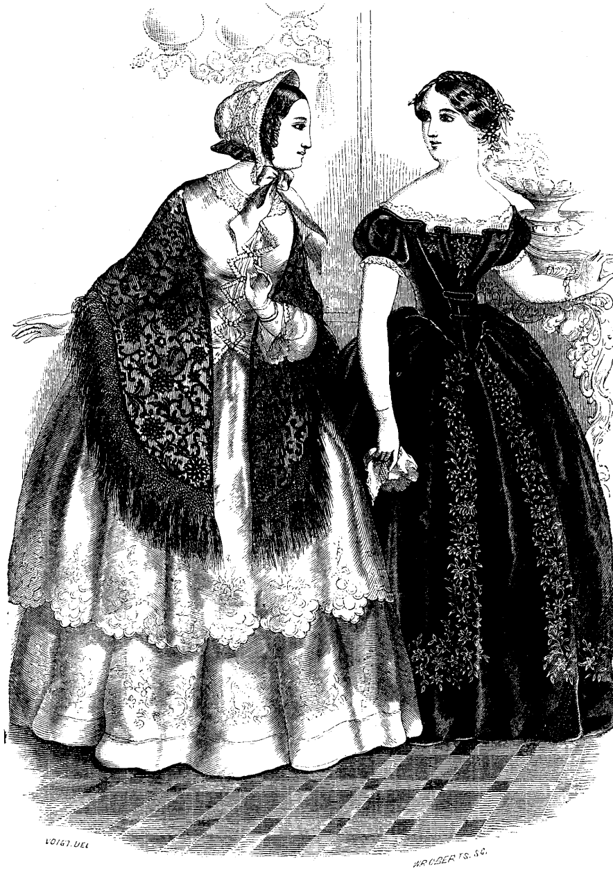
FIGURES 1 AND 2.—PROMENADE AND EVENING COSTUMES.