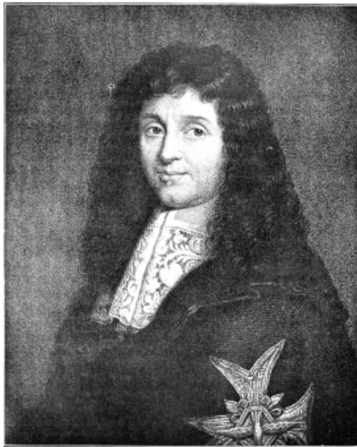
JEAN BAPTISTE COLBERT (1619-83) (He wears a collar of Italian point)

fraise on connoit le veau," for which impertinence the King sent them to prison. Finally the "English Monster" (as it was called in France) gave way to the rabat , or turn-down collar, with its deep-scalloped border of rich point. The turned-back cuffs to match are trimmed in the same manner, and the fashion even extended to boot-tops — of which lace-trimmed boots, the favourite, Cinq Mars, left three hundred pairs on his death in 1642. The contemporary engravings of Callot and Abraham Bosse are eloquent of the prodigal