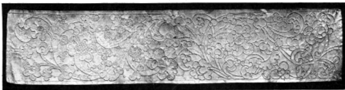
PIECE OF PARCHMENT A PIECE OF NEEDLE-POINT LACE SEVENTEENTH CENTURY