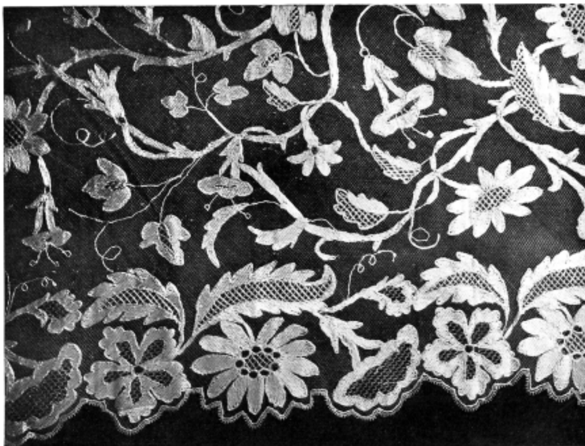
SPANISH BLONDE WHITE SILK DARNING UPON MACHINE NET (MUCH REDUCED)

made lace, and that "more than 2,000 among women and children worked at this industry, and the natives themselves hawked their wares about the country."*