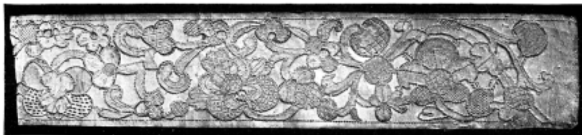
STRIP OF PARCHMENT WITH NEEDLE-POINT LACE IN PROGRESS SEVENTEENTH CENTURY