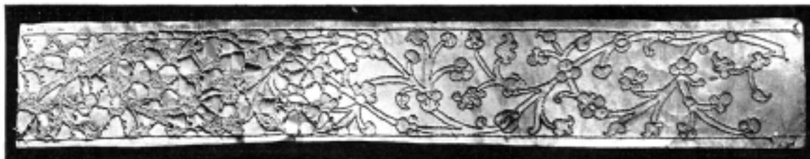
PART OF A PARCHMENT PATTERN WITH NEEDLE-POINT LACE IN PROGRESS PORTUGUESE OR VENETIAN Circa 1650 THE SCROLLS AND FLOWERS ARE ALMOST FINISHED