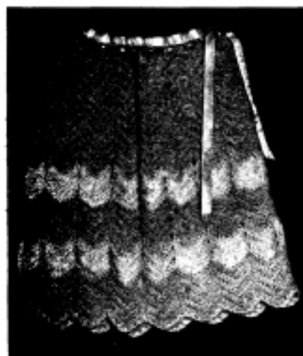
GIRL'S CROCHET SKIRT

THE thumb is widened by picking up from the back part of work the loop which crosses the base of the stitch on which the row is widened, knitting a new stitch on that loop, and afterward knitting the stitch. Knit a gusset at the base of the thumb by casting on four extra stitches. In the four rounds that follow, a decrease of one stitch on each round must be made at the point; this forms one half of the gusset, the other