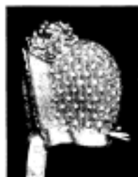
A BABY'S CAP

THE little girl's skirt shown in illustration is made from Germantown yarn. Make a chain several inches longer than the length around the child's waist. The chain should be a multiple of twelve. Take a single crochet stitch into second, third, fourth, fifth, sixth; take two into seventh, one into eighth, ninth, tenth, eleventh and twelfth. In making the next wave or scallop skip the first stitch, and repeat to all stitches of chain. After twenty-five rows are crocheted as above, crochet three rows of double crochet; then twelve rows of single much looser than the single crochet at the beginning; then three rows of double and ten of single. Make two chain stitches and a single crochet into every other stitch as a finish for the edge. Finish the top with two rows of crochet separated by two chain, into which inch-wide ribbon may be run to serve as a string,