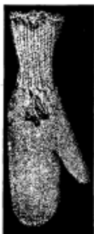
BABY'S SILK MITTEN

THE pretty silk mitten shown in illustration is knit of knitting silk, No. 300; the needles may be either No. 18 or 19. Cast on fifty stitches for the wrist, knit two and purl two stitches for forty rows, then continue plain knitting, gradually widening to the top of the thumb, one stitch on each side, till it is eighty stitches at the widest part. Then put the extra stitches for the top of the thumb on a string, and go on knitting the hand, gradually narrowing