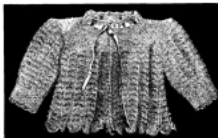
INFANT'S SACQUE WITH YOKE

IN KNITTING the sacque the first row of the pattern is not knitted at the edge. Begin with second row. First row of pattern is knit of knitting silk in the next two repetitions of the pattern. The pattern is repeated fourteen times in the length of the sacque and twenty-seven times in the width. The yoke of the sacque is knit of four-thread Saxony. For the front of the yoke the pattern is narrowed three times in the