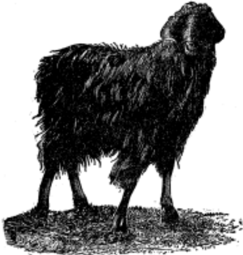
FIG. 2.—Nubian Goat.

The Nubian goat, which is met with in Nubia, Upper Egypt and Abyssinia, differs greatly in appearance from those previously described. The coat of the female is extremely short, almost like that of a race-horse, and the legs are long. This breed therefore stands considerably higher than the common goat. One of its peculiarities is the convex profile of the face, the forehead being prominent and the nostrils sunk in, the nose itself extremely small, and the lower lip projecting from the upper. The ears are long, broad and thin, and hang down by the side