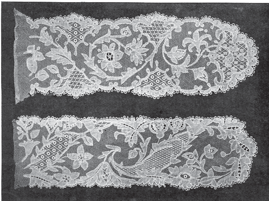
LAPPETS IN CARRICKMACROSS APPLIQUÉ.