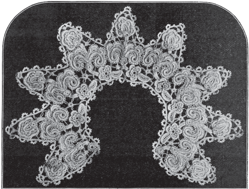
COLLARETTE, CLONES CROCHET GUIPURE.