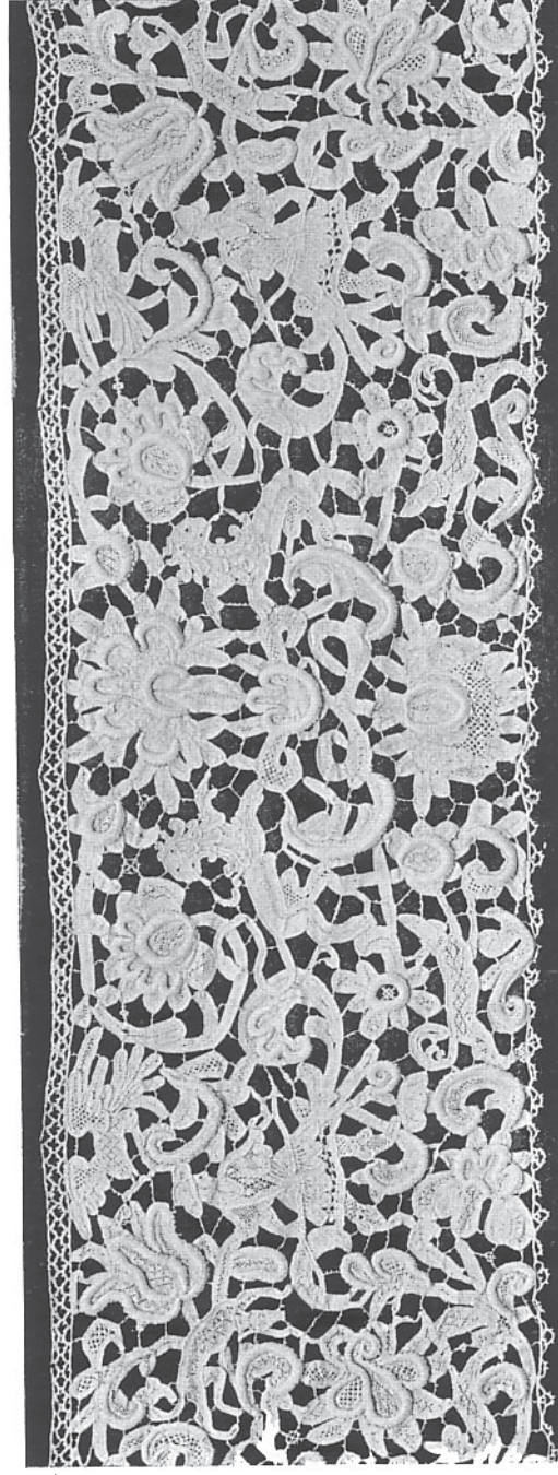
VENETIAN TAPE GUIPURE, MEZZO PUNTO OR PUNTO DI VENEZIA COL NASTRINO SECOND HALF OF SEVENTEENTH CENTURY