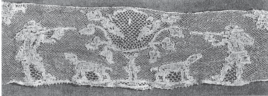
MECHLIN LACE, EIGHTEENTH CENTURY