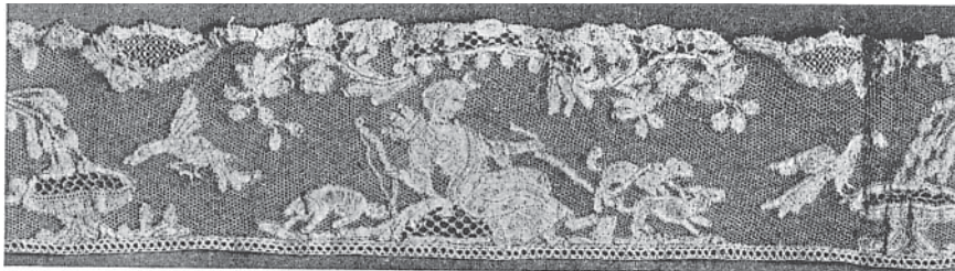
POINT D'ANGLETERRE, PERIOD LOUIS XV

The two pieces of lace belonging to the Metropolitan Museum, which are the head and tail-pieces of these notes, seem to have been made to outline the necks of ladies' dresses and form the "engaging" ruffles at their elbows, as we see them in the portraits of the time of Nattier and Watteau, when Alençon was a "winter lace" and Mechlin was considered more appropriate for summer wear. The head-piece is a delightful bit of Mechlin, the tail-piece a charming strip of point d'Angleterre having for its subject Diana, the goddess of the hunt, with her dogs.