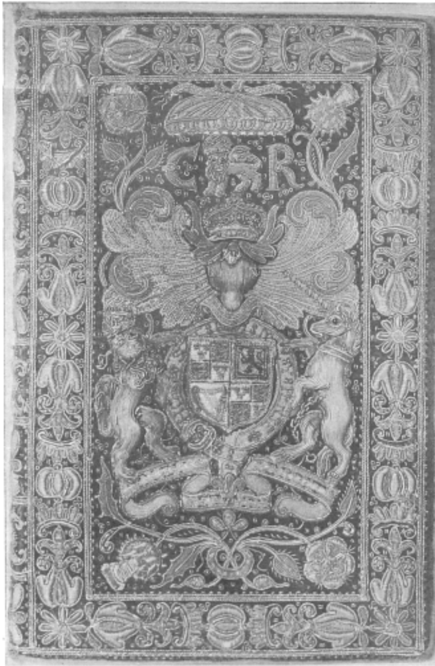
BIBLE OF KING CHARLES I