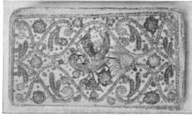
EMBROIDERED BINDING ENGLISH, 17TH CENTURY