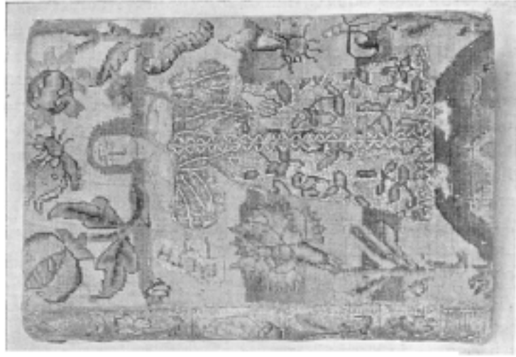
BINDING IN "PETIT-POINT" ENGLISH, 17TH CENTURY