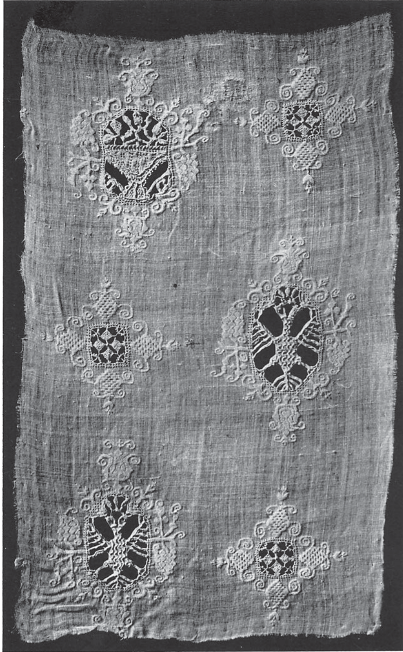
PORTION OF CUSHION COVER, FINE LINEN, RETICELLO AND PUNTO IN ARIA WITH DEVICE OF KING PHILIP IV OF SPAIN, XVII CENTURY