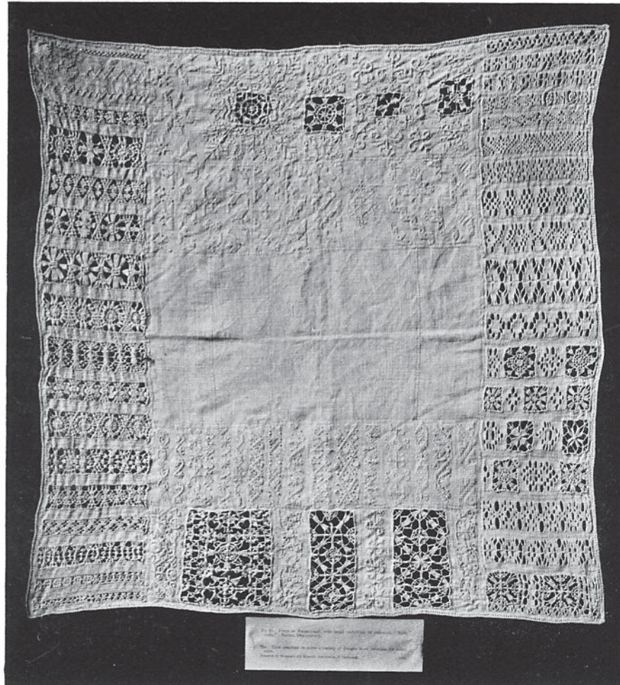
SAMPLER, ITALIAN XVI OR XVII CENTURY CINCINNATI MUSEUM