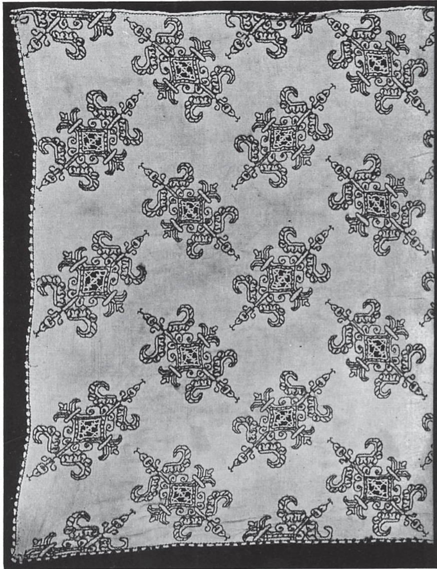
PORTION OF CUSHION COVER EMBROIDERED WITH RED SILK AND WITH CUTWORK ITALIAN, XVI CENTURY