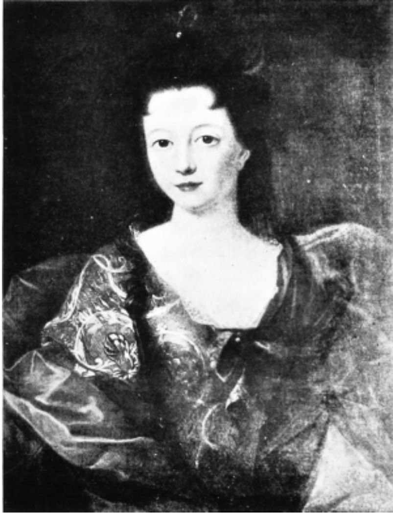
MARIE ANNE DE BOURBON, PRINCESS OF CONDÉ ATTRIBUTED TO SANTERRE THE ORIGINAL AT HAMPTON COURT PALACE