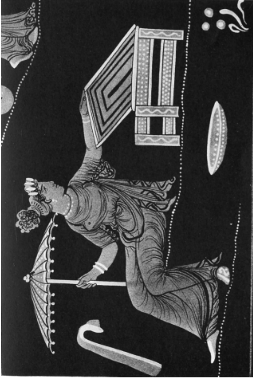
DETAIL FROM AN APULIAN VASE OF THE FOURTH CENTURY B. C. IN THE BERLIN MUSEUM. ACCORDING TO JUVENAL SUCH PARASOLS WERE ALSO USED FOR RAIN.