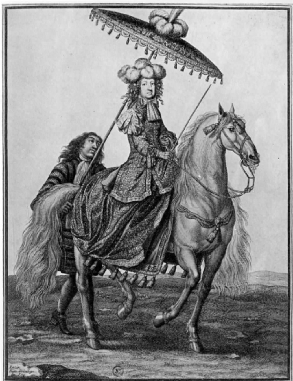
Marie Thérèse d'Autriche. Reine de France & de Navarre.