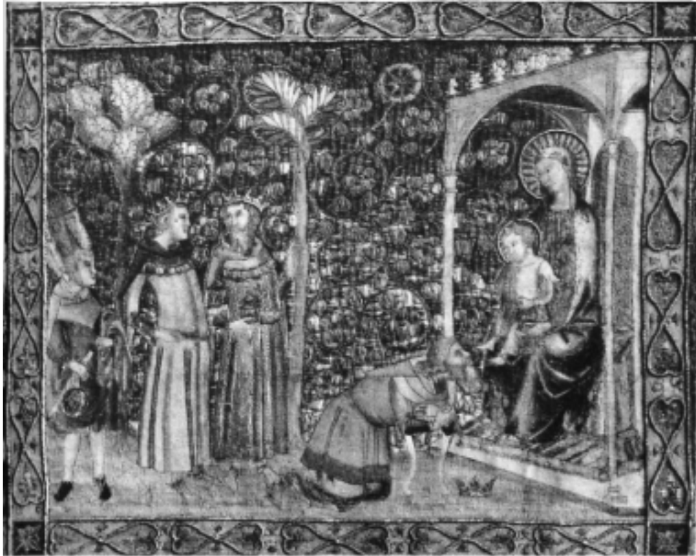
"THE ADORATION." EMBROIDERED PANEL FROM THE ALTAR FRONTAL, SIGNED BY GERI LAPI OF FLORENCE, IN THE CATHEDRAL OF MANRESA, NEAR BARCELONA, SPAIN. AN ENLARGEMENT OF THE FIGURES OF THE TWO KINGS IN THE PANEL WILL BE FOUND ON PAGE 42.