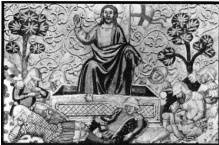
"THE RESURRECTION." EMBROIDERED PANEL IN THE STYLE OF THE MANRESA ALTAR FRONTAL. ITALIAN, XIV CENTURY. IN THE COLLECTION OF THE CLEVELAND MUSEUM OF ART.