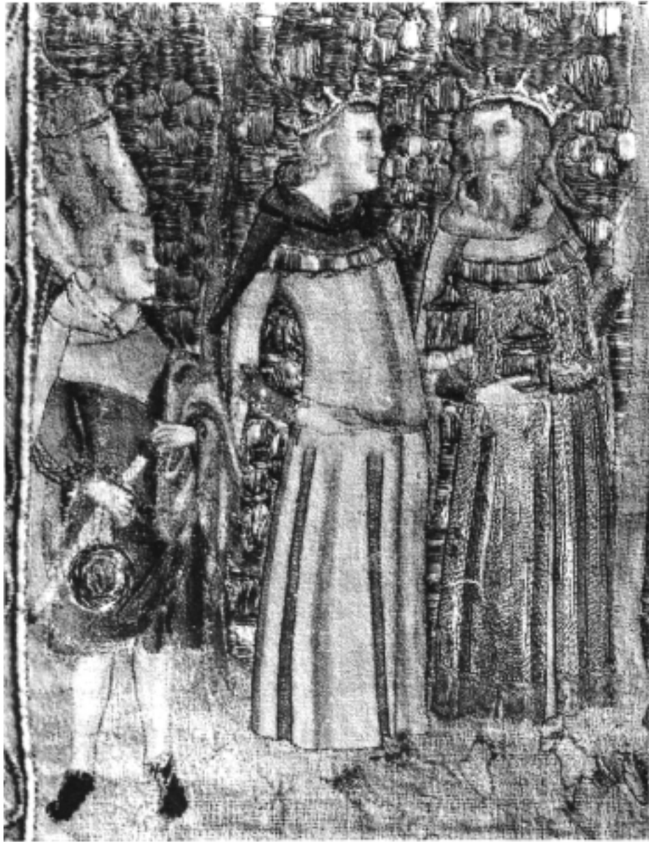
DETAIL FROM "THE ADORATION" PANEL SIGNED BY GERI LAPI.