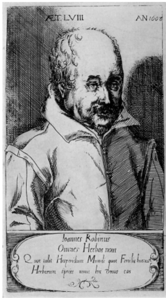
FIG. 3 PORTRAIT OF JEAN ROBIN. IN LE JARDIN DU ROY.