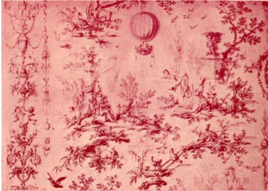
PLATE XVI—L'AEROSTAT DANS LE PARC DU CHÂTEAU. FRAGMENT SHOWING IN REVERSE ALTERATION OF FIRST STATE OF PLATE WITH THE INTRO- DUCTION OF AN ASCENDING BALLOON. (NO. 265 B OF CATALOGUE, P. 17.)