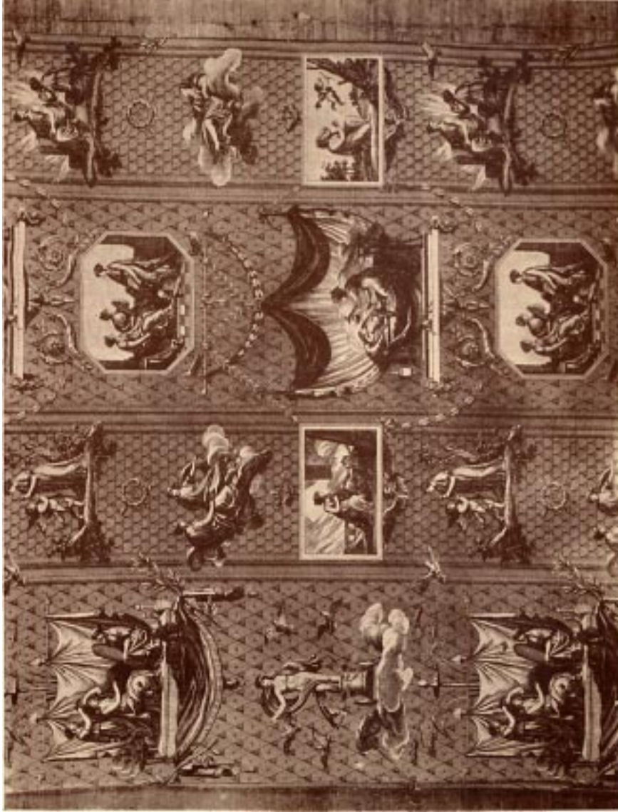
PLATE VIII—PSYCHÉ ET L'AMOUR. MONOCHROME IN SEPIA FROM COPPERPLATE, 1810. HUEI'S THIRD STYLE AND LAST DESIGN. FROM THE AUTHOR'S COLLECTION.