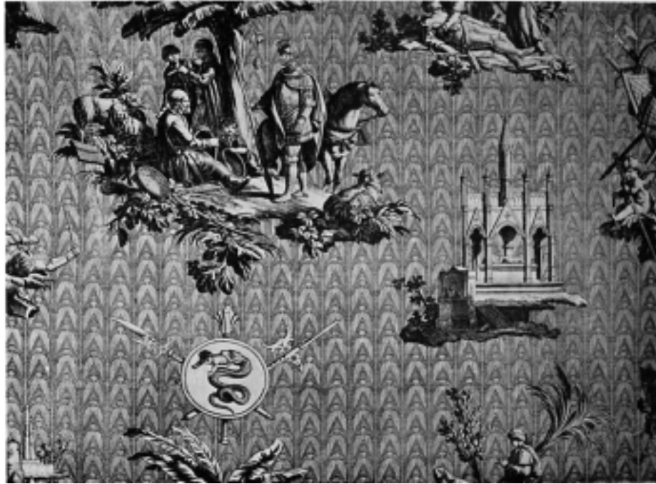
PLATE XII—SCÈNES DES CROISADES. MONOCHROME IN GREY FROM COPPERPLATE. HUET'S THIRD STYLE. THE COAT OF ARMS IS THAT OF THE VISCONTI FAMILY. FROM THE AUTHOR'S COLLECTION.