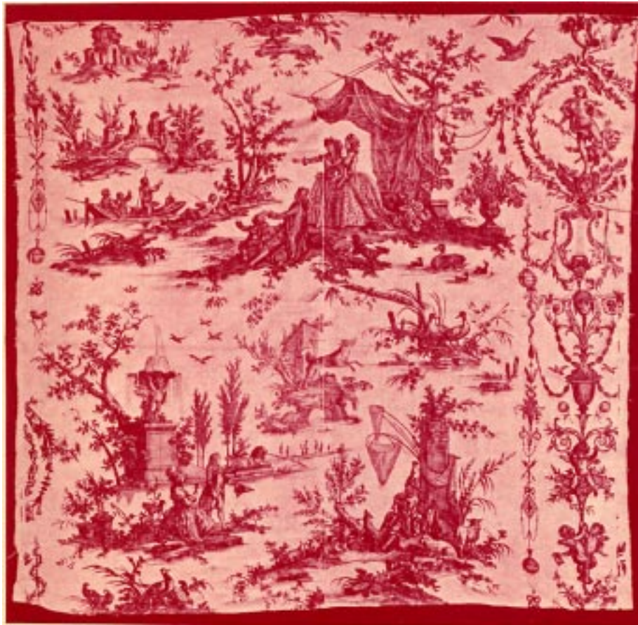
PLATE XV—LE PARC DU CHÂTEAU.

MONOCHROME IN RED FROM COPPERPLATE. HUET'S SECOND STYLE.