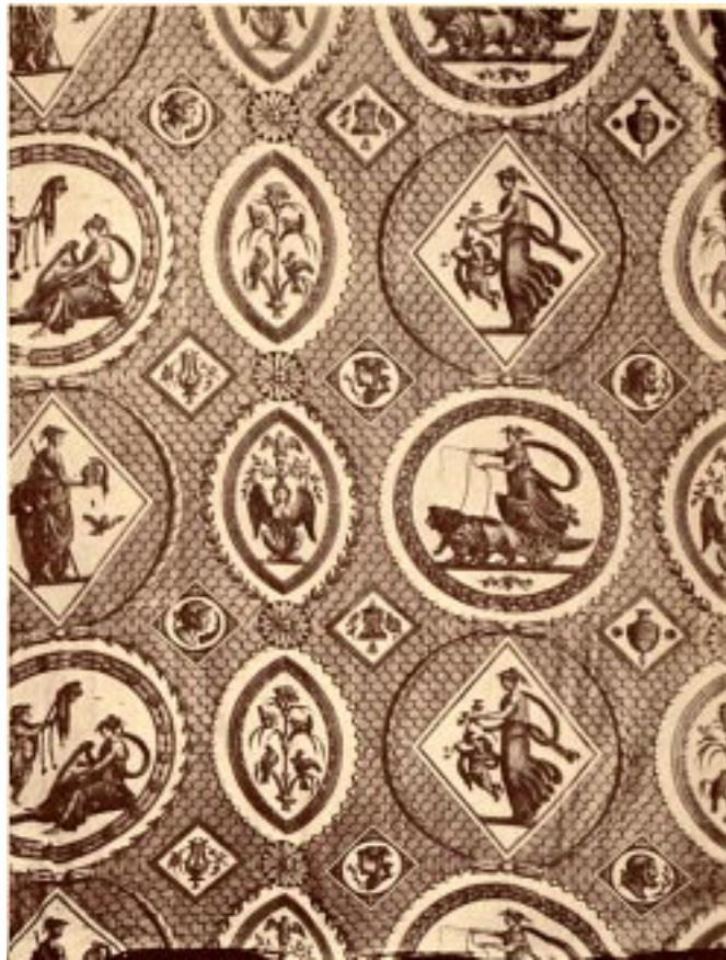
PLATE X—SCÈNES ANTIQUES. MONOCHROME IN SEPIA FROM COPPERPLATE, ABOUT 1805. HUET'S THIRD STYLE. FROM A BED SET OWNED BY THE AUTHOR.