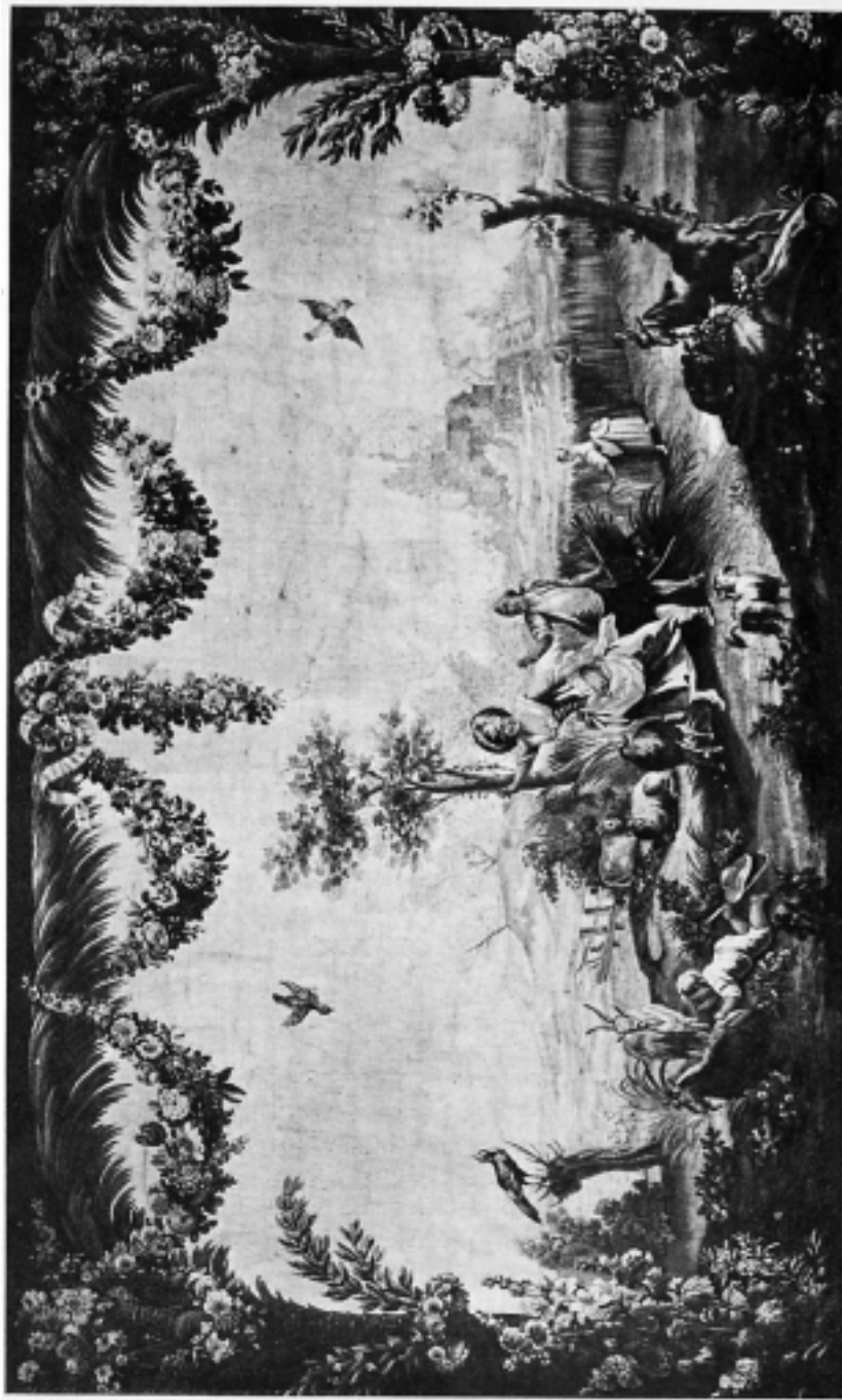
PLATE XI—THE HARVEST. FROM A SET OF PASTORAL TAPESTRIES FROM THE COLLECTION OF PRINCE MURAT, DESIGNED BY JEAN-BAPTISTE HUIET AND WOVEN AT THE BEAUVAIS MANUFACTORY FROM 1786 TO 1790.