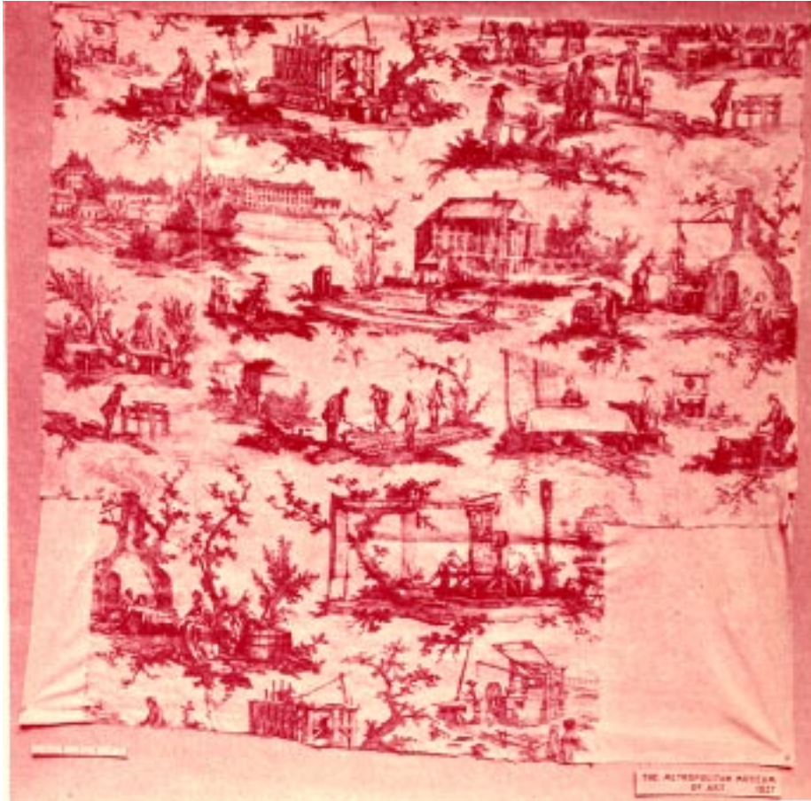
PLATE I—LES TRAVAUX DE LA MANUFACTURE. MONOCHROME IN RED FROM COPPERPLATE. FRENCH, JOUY, 1783. FIRST DESIGN FOR JOUY OF JEAN-BAPTISTE HUET.