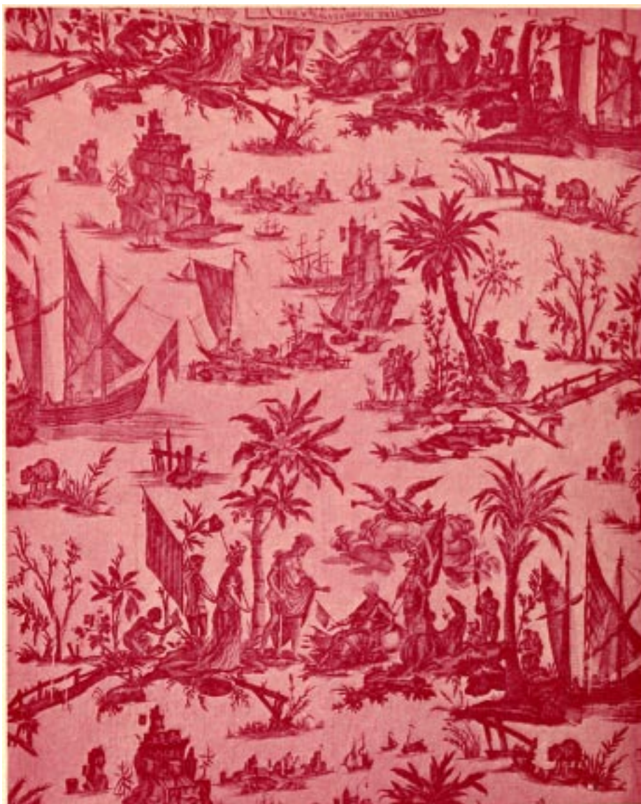
PLATE III—L'HOMMAGE DE L'AMÉRIQUE À LA FRANCE. MONOCHROME IN RED FROM COPPERPLATE. FRENCH, JOUY, 1785. DESIGN OF JEAN-BAPTISTE HUET.