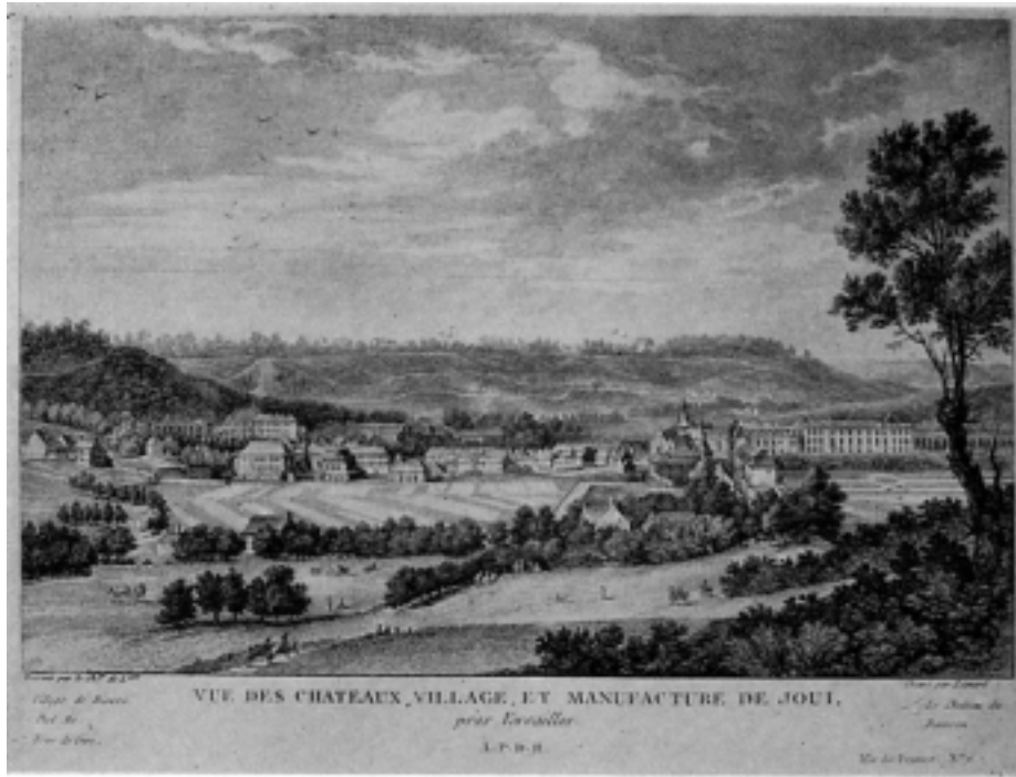
PLATE V—THE TOWN, CASTLE AND OBERKAMPF FACTORY AT JOUY. ENGRAVING (ABOUT 1785) FROM LABORDE'S Voyage Pittoresque de la France .