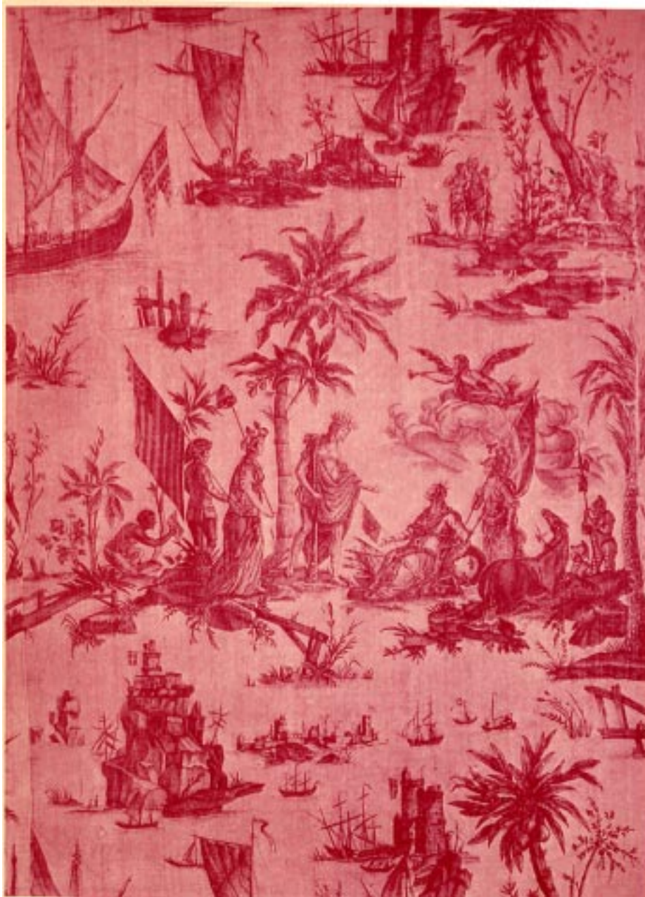
PLATE II—L'HOMMAGE DE L'AMÉRIQUE À LA FRANCE.

THIS PLATE IS AMONG THOSE PRODUCED BETWEEN 1785 AND 1790 AND IS ONE THAT WAS SUBJECTED TO SEVERAL ALTERATIONS. IN THE ORIGINAL CARTOON THE INDIAN IS UNDRAPED AND THE FIGURE OF FRANCE WEARS A CROWN AND THE ORB AND FLAG BEAR THE FLEUR-DE-LIS. THE INDIAN IN THIS DESIGN IS DRAPED WHICH SHOWS IT TO BE THE SECOND STATE OF THE PLATE. IN THE GROUP AT THE LEFT PORTRAYING AMERICA WE HAVE THE DRAPED INDIAN; AMERICA WITH THE LIBERTY POLE AND CAP, THE TRAPPER WITH THE AMERICAN FLAG AND THE CROUCHING SLAVE AS ORGINALLY DESIGNED. AFTER THE DEPOSITION OF THE KING AND QUEEN THE CROWN WAS REMOVED FROM THE ORB AND FLAG (SEE PLATE III). THIS REPRODUCTION IS FROM A SPECIMEN IN A ST. LOUIS MUSEUM OF ART, ORIGINALY FROM THE AUTHOR'S COLLECTION.