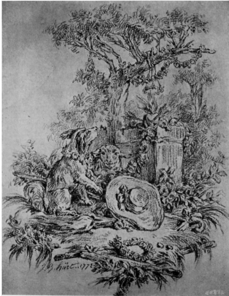
PLATE VI—SANGUINE DRAWING. JEAN-BAPTISTE HUET. FROM THE COLLECTION OF THE MUSEUM FOR THE ARTS OF DECORATION, COOPER UNION, NEW YORK.