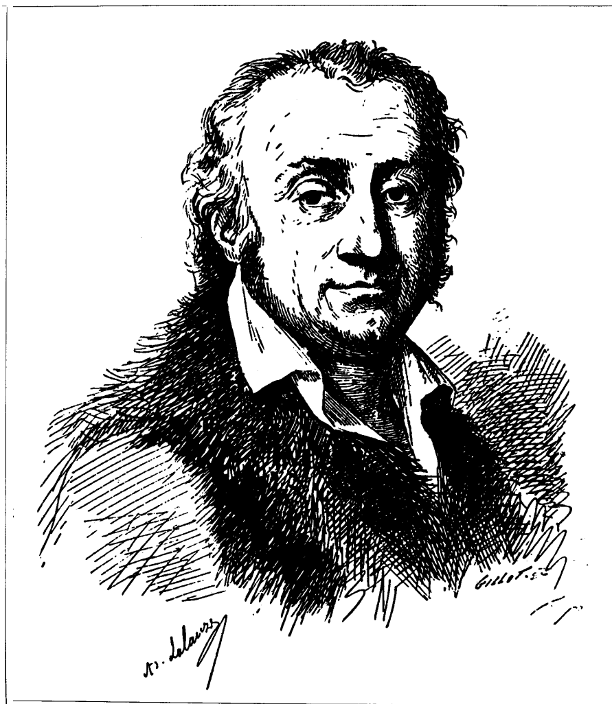
JEAN-BAPTISTE HUET. FROM A DRAWING BY LALAUZE. AFTER THE MINIATURE OF VILLIERS-HUET, SON OF JEAN-BAPTISTE HUET.