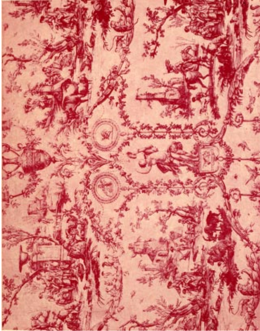
PLATE IV—LA LIBERTÉ AMERICAINE. MONOCHROME IN ROSE FROM COPPERPLATE. FRENCH, JOUY, 1784. DESIGN OF JEAN-BAPTISTE HUEY.