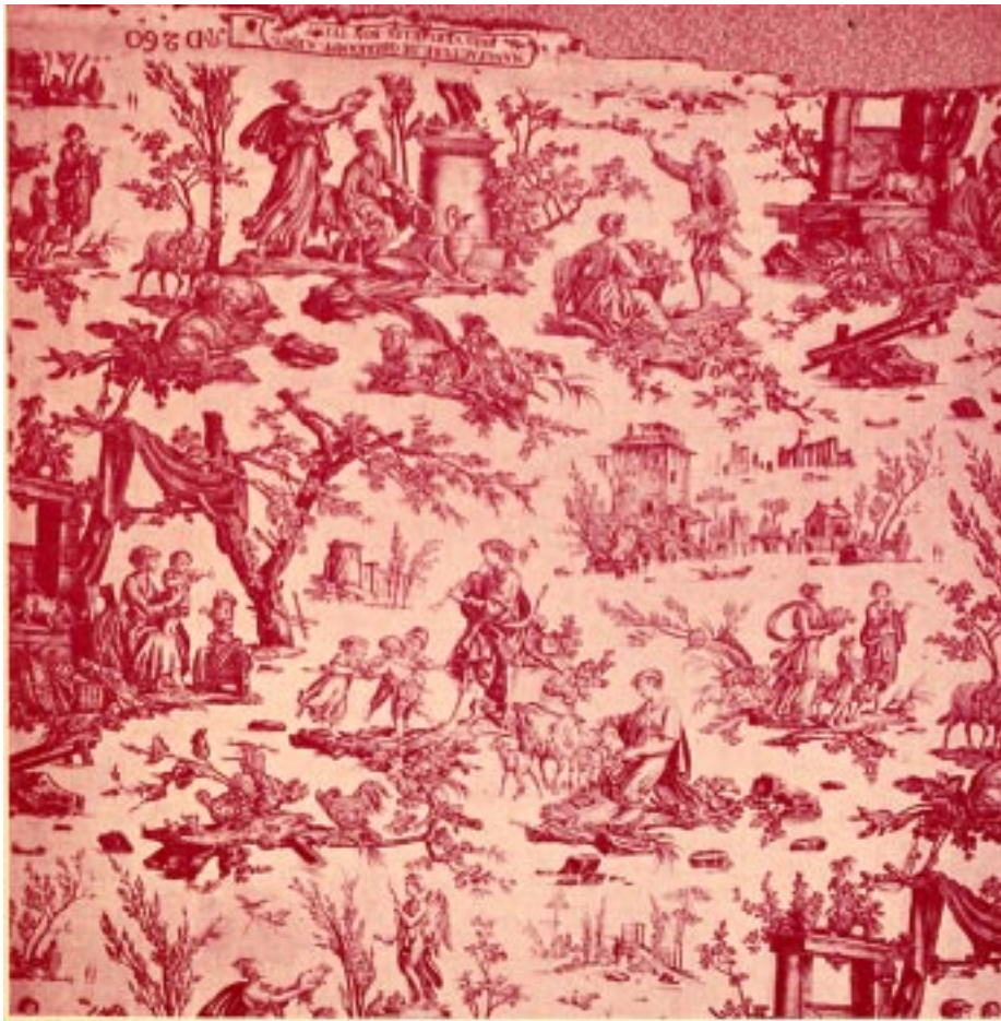
PLATE IX—OFFRANDE À L'AMOUR. MONOCHROME IN RED FROM COPPERPLATE, ABOUT 1804. A RETURN TO HUET'S EARLIEST STYLE. THE PIECE SHOWS THE FACTORY MARK—"MANUFACTURE DE OBERKAMPF À JOUY PRÈS VERSAILLES, BON TIENT." FROM THE AUTHOR'S COLLECTION.