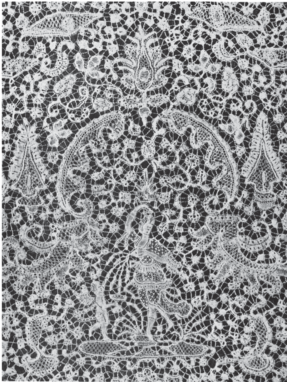
PLATE III DETAIL OF PLATE II.