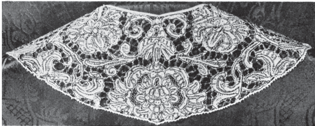
PLATE I COLLAR OF BOBBIN LACE, FLEMISH OR ITALIAN. SEVENTEENTH CENTURY.