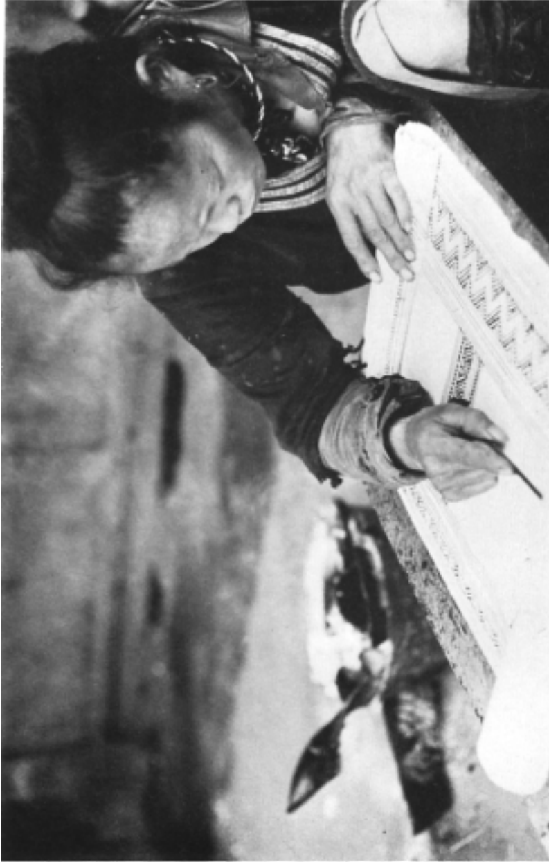
6. Mao woman batik: The wax-resist method creates black fabric with white design.