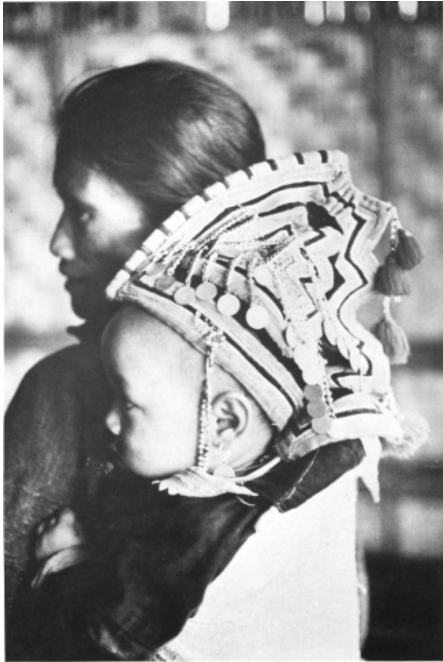
5. Mao baby and mother