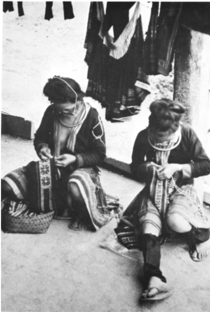
8. Mao women embroidering: Missionaries have given them eye glasses to prevent their loss of vision from this intricate work.