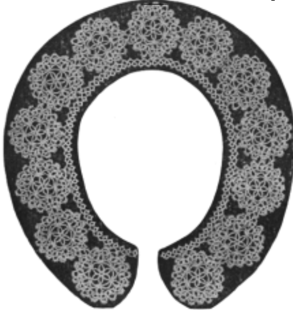
A Round Yoke Which May Serve as a Collar By Mrs. Fleeda Galley

diation, picot, (10 double knots, picot) twice, 5 double knots, join to middle picot of ring; 5 double knots; a ring, joining by middle picot to middle picot of 1st free ring of 1st medallion of strip; chain of 5 double knots; a ring; a chain of 5 double knots, join to picot of preceding long chain, and repeat. Join next 2 upper rings to 2d and 3d free rings of same medallion; join next upper (or 2d) ring to same picot with preceding upper ring, which brings 3 rings together; * continue until you have 3 free rings, join next to 2d free ring of 2d medallion, next to the 3d free ring of same medallion, and repeat from *, ending as begun by joining 3 rings in a group to the 3d free ring of last medallion (counting from the opening), and a ring to each of next 2 free rings toward the front; join last chain to middle picot of last ring, and fasten off.