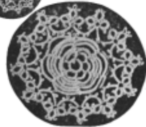
Detail of the Medallion

with needle and thread after all are completed, and if carefully done they will not be noticeable. Pass the needle through the 2 picots to be joined and tie the thread securely on the wrong side. It is also easier to join the medallions in rows, rather than to begin at the center. First join three medallions by 2 picots at each side; in the next row are four medallions, the 1st joined in the manner directed to 1st 2 of the free cloverleaves of 1st row, the 2d to