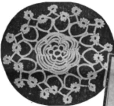
Detail of the Medallion

with needle and thread after all are completed, and if carefully done they will not be noticeable. Pass the needle through the 2 picots to be joined and tie the thread securely on the wrong side. It is also easier to join the medallions in rows, rather than to begin at the center. First join three medallions by 2 picots at each side; in the next row are four medallions, the 1st joined in the manner directed to 1st 2 of the free cloverleaves of 1st row, the 2d to