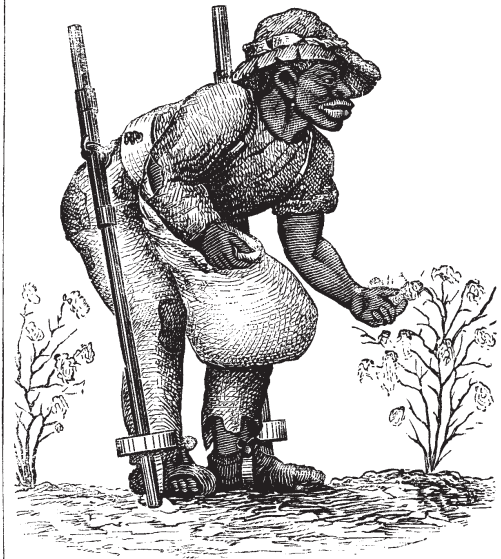
FIG. 1.—SUPPORTER FOR COTTON-PICKER.

DESIGNED to be worn by cotton-pickers while at work; and consists of two wooden staffs, having peculiarly constructed foot-rests pivoted at the bottom, and sliding connections near the centre of the same, adapted to act in connec-