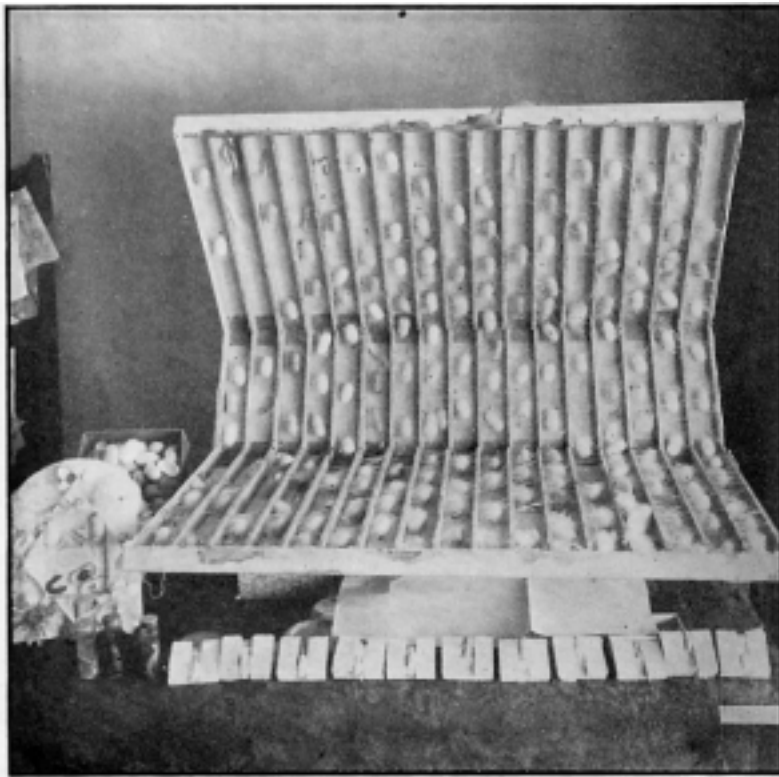
Canopy and tray showing cocoons.

Thus it may be noted that not only may silk be produced in California of a better quality than we import from foreign countries, but also that there is an open market for silk eggs. Especially may this be emphasized because in all silk-producing countries of Europe and Asia traces of that fatal disease still linger, while here there is found no trace of disease. Nor could such disease ever be found here, for it originated in filth and neglect of the worms while rearing them in overcrowded dwellings, with little means of ventilation.