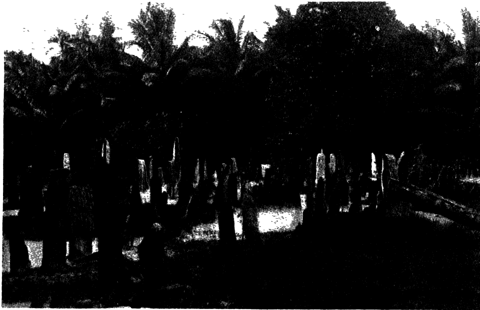
FIG. 2.—GRAVEYARD OF THE COMMON PEOPLE (MAIUA), LORD HOWE.