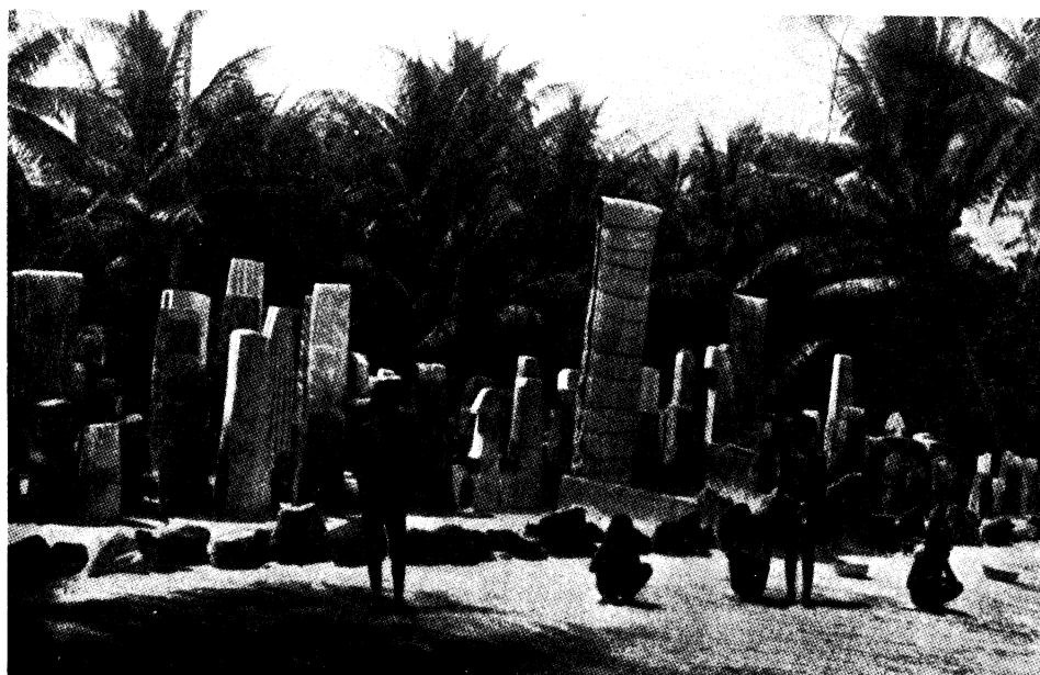
FIG. 1.—GRAVEYARD OF THE MEMBERS OF THE KING'S FAMILY (TU'U), LORD HOWE.

"In the village Toboroi on the east coast of Bougainville the inhabitants on my return from the mountain villages had prepared a feast; I do not mention it on account of its culinary accomplishments, but because I found the food served in plaited trays and baskets of a shape which I have not observed in any other part of Bougainville. Three characteristic shapes were represented. Circular dishes were used for serving boiled fish. These dishes had a circular bottom of 40-60 cm. in diameter