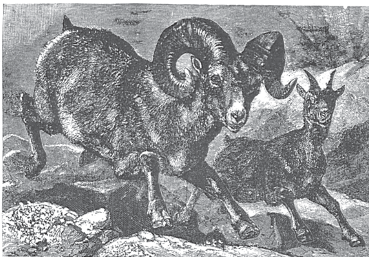
WILD SHEEP: Big Horn or Rocky Mountain Sheep.

Whipcord: —A diagonal weave, with strongly marked ribs or cords. Hard twisted worsted twills, either solid or mixed colors. The name is from the hard twisted fibre lash of a whip. The weave was originally used exclusively in riding-breeches, being an imitation of corduroy. It afterwards found favor as a suiting fabric, and very shortly came to be copied in woolen dress fabrics.