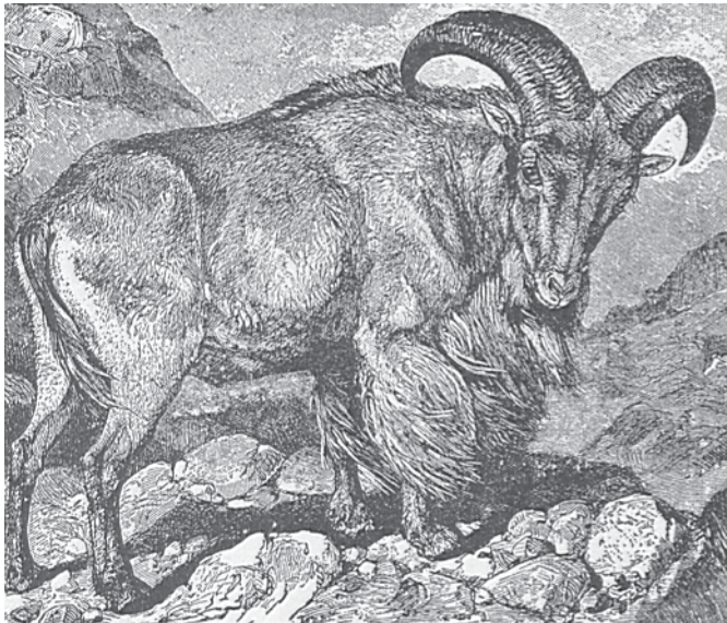
WILD SHEEP: The Audad or Bearded Argali.

Mountain sheep of California; the Aoudad, or bearded Argali, of Africa; and the Mouflon of Europe. A sub-variety of the Mouflon family is the Nemorhedinae, or goat-like antelope. One more sub-family is comprised in the species