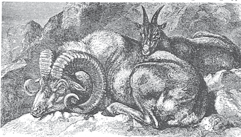
WILD SHEEP: Argals of Siberia.

starches, neither is it so clear and transparent; and it does not stiffen cloth quite as much, and is therefore mostly used for soft and light finishes. It is usually sold as a white powder, with a slight crisp feel and glistening appearance.