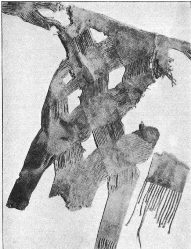
First Example of Cotton Knitting from Cliff Dwellers of Utah.

In the Museum of the Smithsonian Institute at Washington is a fragment of a Salish blanket, illustrated on a preceding page. It was originally collected by the great naturalist, Audubon, and secured by him perhaps from the Lewis and Clark expedition.