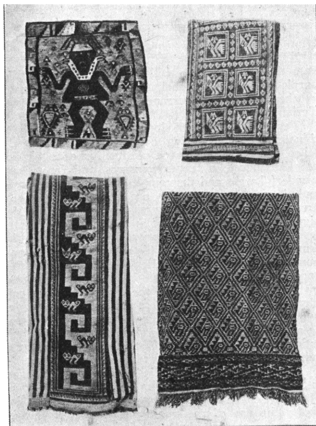
Prehistoric Peruvian Fabrics Showing Tapestry, Double-Cloth and Brocade Weaving.

The moist climate in the former area has destroyed