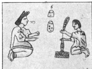
Aztec Mother Teaching Daughter to Spin.

There are three distinct phases in the history of American textiles. In their chronological order they are as follows: The Pre-Columbian textile arts, the European craft arts, introduced by the early Colonists and the great age of automatic machinery and serial production which began in this country with the building of the first Slater Mill in Pawtucket, R. I., in 1793 and which, passing through a brilliant period of new inventions and modifications of old, the intensification and broadening of organization, has now