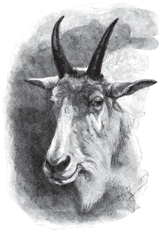
Head of a White Goat.

mile long and ended in a high cliff, over which the stream poured. If hunted and hunters kept along on their respective sides, they would come together at its head. Hidden by the trees, we went on, timing our advance by the goat's progress, and at length when we reached the end of the valley, the animal was on the slide-rock above us and only eighty yards distant.