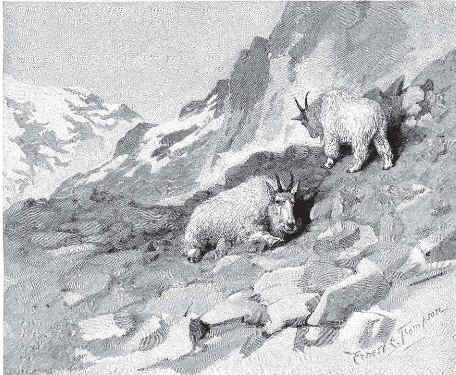
The White Goat at Home.

before us. First above the valley's level we were confronted by the talus, above that by a thousand feet of cliff, and then by other slide-rock and more cliffs, in all nearly five thousand feet, if we could climb so far. The slope at the foot of the cliff was, perhaps, fifteen hundred feet high; a mass of small rock fragments, rather firmly compacted with earth and vegetation, that lay at an angle of nearly forty-five degrees, so that the climbing was extremely steep and slow. After working our way nearly to the top of this talus, we found running along it, under the cliff, a game trail, and we followed this, knowing that it would take us to some point where the precipice which overhung us could be climbed. The trail worked higher up on the talus, and led us to a break in the cliff, where there were some fissured ledges, which promised an ascent for a few hundred feet at least. Everywhere the path showed signs of abundant use; the angles of the rock were worn and