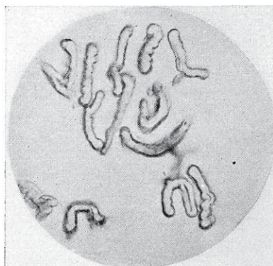
Fig. 1. Cross-section of Imitation Wool Fibers

form is quite characteristic and aids greatly in identification of the material in which it appears.