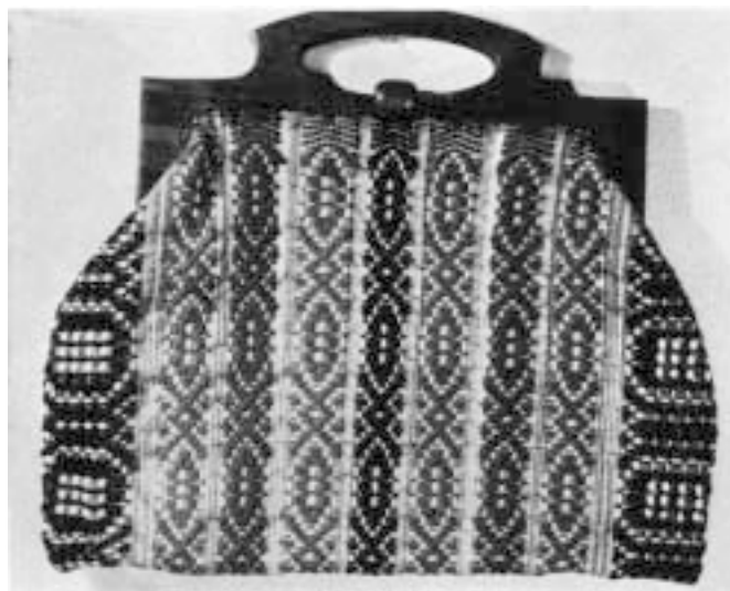
COLORS BLACK GREEN BLUE RED BLACK RED BLUE GREEN BLACK