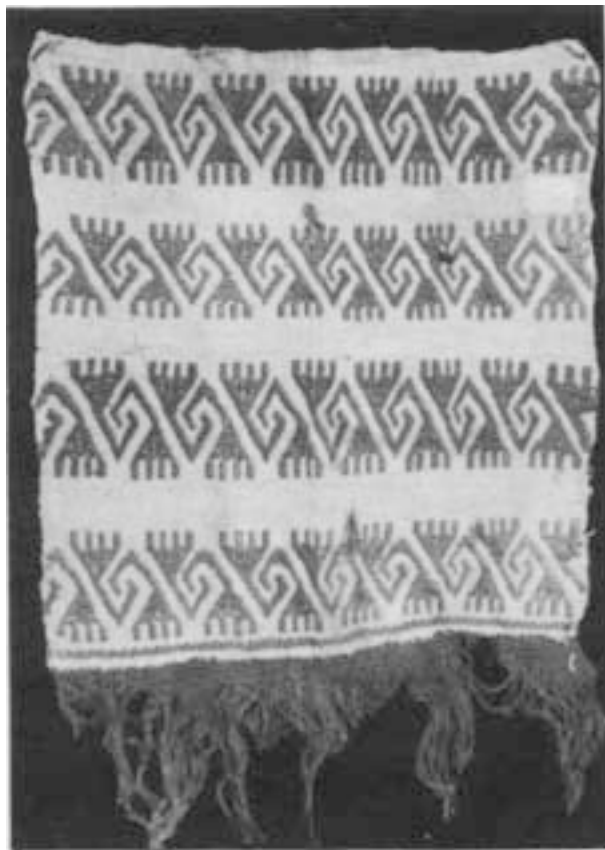
Peruvian Brocade with Tapestry Woven Fringe

the warp threads, and the flat stick for the opposite shed. It seems almost unbelievable that all of the beautiful fine fabrics of these ancient people were woven on a loom no more complicated than this. One narrow tapestry ribbon which I have has 80 warp threads to the inch, and 320 weft threads of very fine wool to the inch. It is my contention that more people today would learn how to weave if it were not for the expense involved in buying a large loom. Certainly much more can be done with such simple equipment than is being done, although to use this loom well does require more skill and patience on the part of the weaver. A description of this type of loom was given in detail in "Handweaving News"