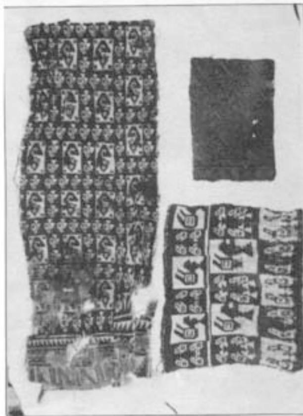
Three Double Woven Peruvian Fabrics

on each edge, quite a number of pieces of plain fabric in which mummies were wrapped, bunches of cotton with the seeds still in them, bits of colored pottery, shells etc. There is still a very large area at Pachacamac which has not been excavated at all. No one knows the wonderful discoveries which are waiting there still covered with the ever drifting sands.