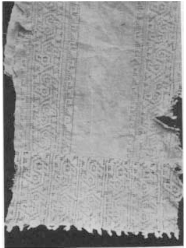
A Tapestry Woven Gauze Fabric

especially on this piece that the figures on the extreme left are very indistinct. This might have been due to the fact that these last weft threads were darned in with the needle. It is possible that such a piece was used as a handkerchief, for I have a number of these in my collection. The large piece of double weaving at the right is an interesting combination of the bird and fish motif, and has an attractive border at the top. It was part of a large mantas, and I have several pieces of this same pattern. The small piece at the bottom left of Figure No. 3 is of very fine thread and also an interlocked fish and bird design of brown and white. It is possible to do double weaving on the four harness loom, and for those who are interested in learning how, I will refer you to "Lesson on How To Do Double Weaving on the Four Harness Loom" by the author of this article. This lesson is described in simple clear directions and includes the loan of a sample of the weave. Since March of 1934, when directions for this technique were published for the first time in the English language in the above mentioned "Lesson", many weavers have availed themselves of the opportunity to learn how to do it. For it is not difficult, and any design which can be drawn out on cross section paper may be woven.