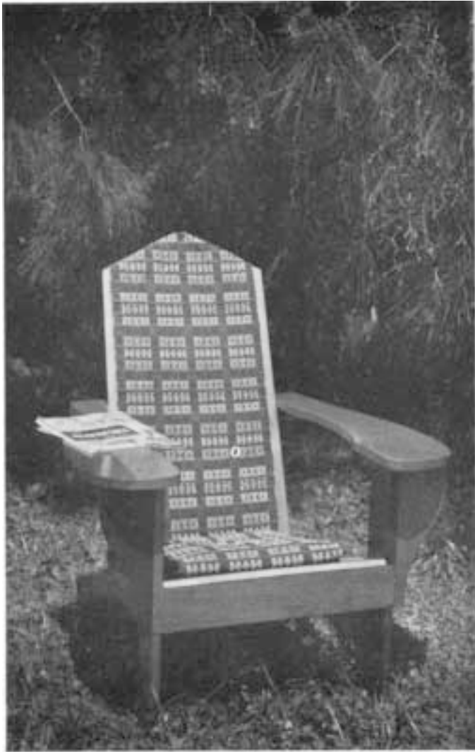
Illustration No. 2