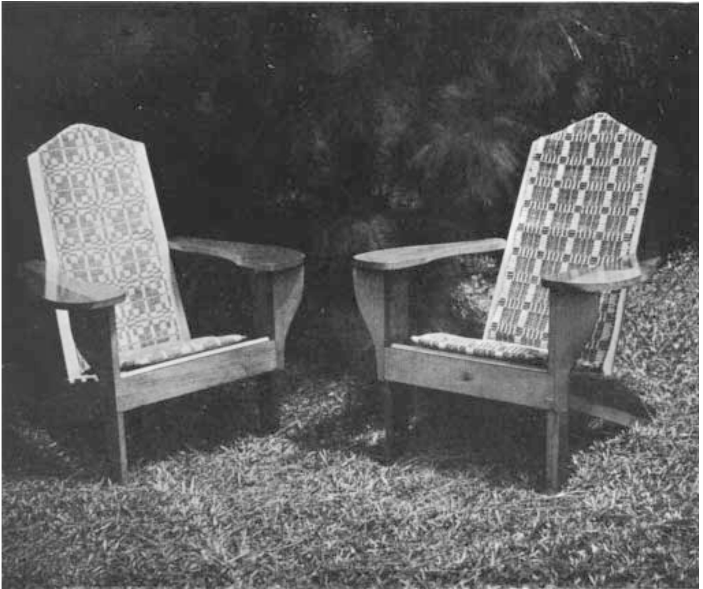
Illustration No. 1

The wooden slat chairs, which are so popular for porch and lawn, are gayer, as well as more comfortable, with some simple covering. The following experiments were made with hand woven strips for backs and seats.