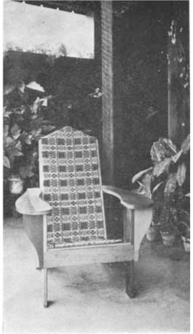
Illustration No. 3

Treadle 2, 3 shots brown No. 1318 Treadle 4, 1 shot orange No. 1352 Treadle 2, 3 shots brown No. 1318 Treadle 4, 1 shot orange No. 1352 Treadle 2, 3 shots brown No. 1318 Treadle 3, 2 shots yellow No. 1351 Treadle 1, 2 shots yellow No. 1351