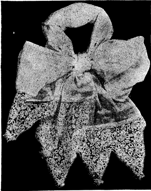
FIGURE NO. 1.—SCARF OF MULL WITH MODERN LACE ENDS.

The "twice-around-the-neck" scarf of mull, chiffon, net or