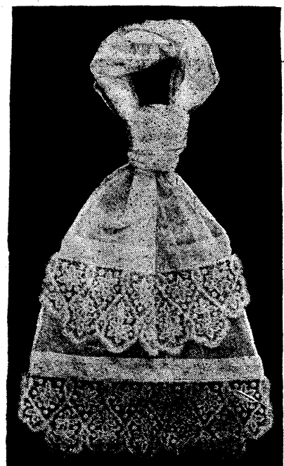
FIGURE NO. 4.—NET SCARF, WITH MODERN LACE ENDS.