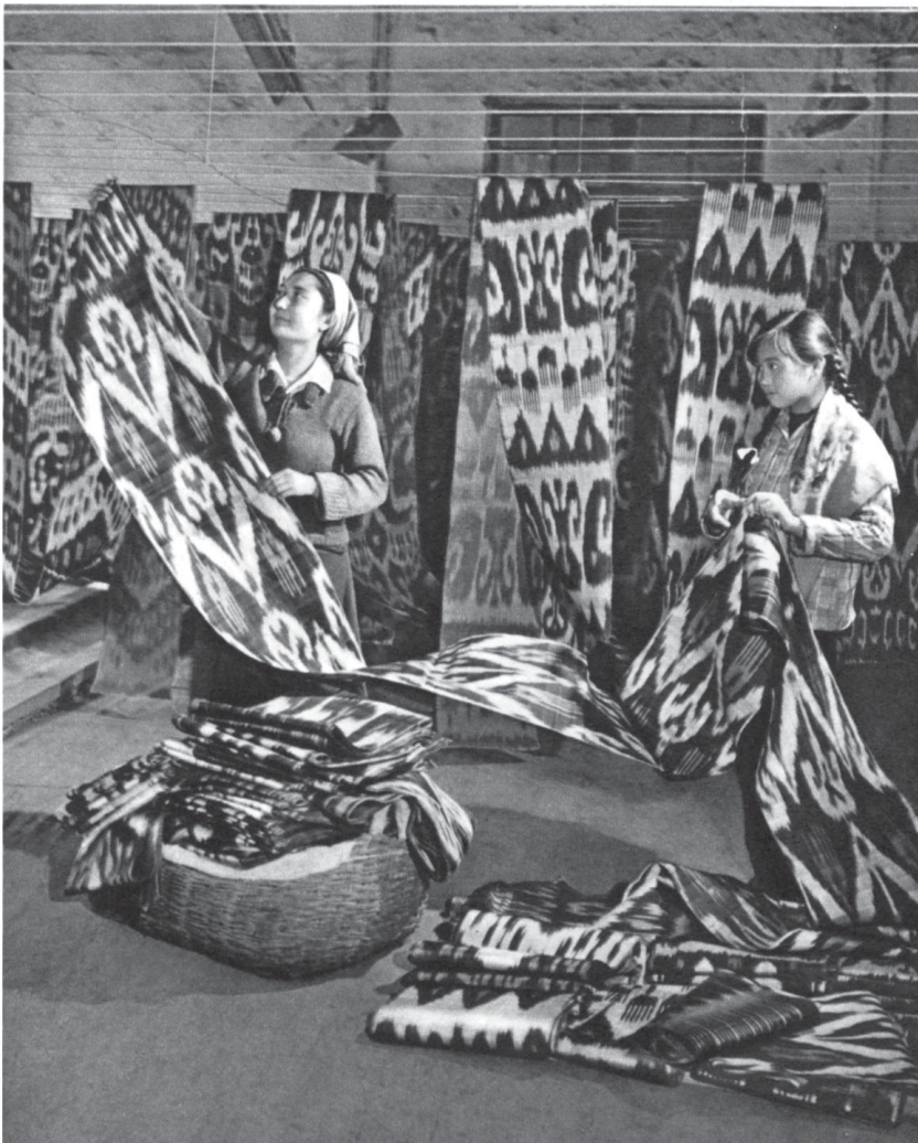
"Ai-te-lai-su", a favorite material of the local people now being manufactured in large quantities