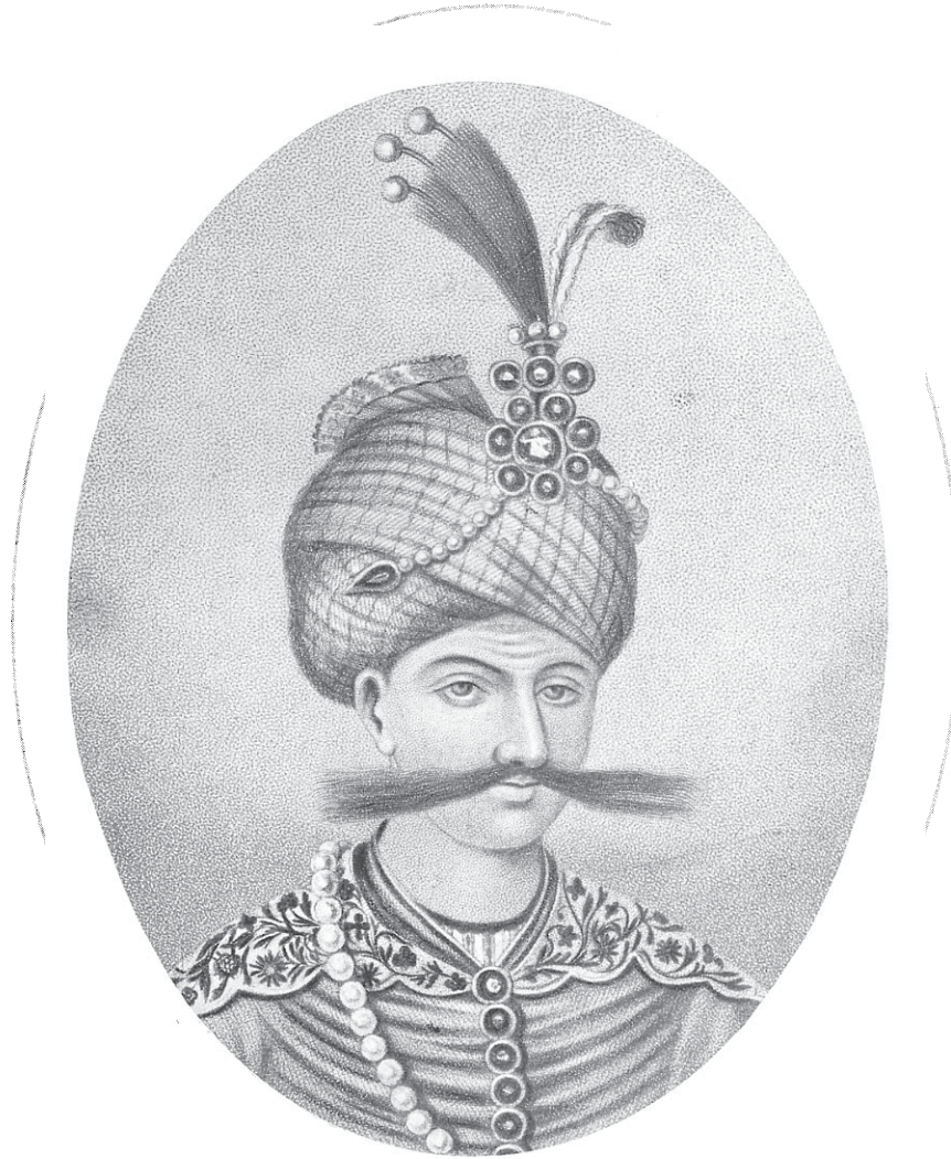
SHAH ABBAS THE GREAT