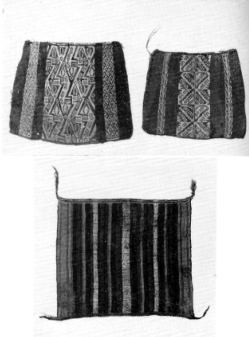
PLATE 128.—Prehistoric textiles from the vicinity of Arica. Coca bags and kerchief have two-face warp design, the most elaborate weaving produced in the area.