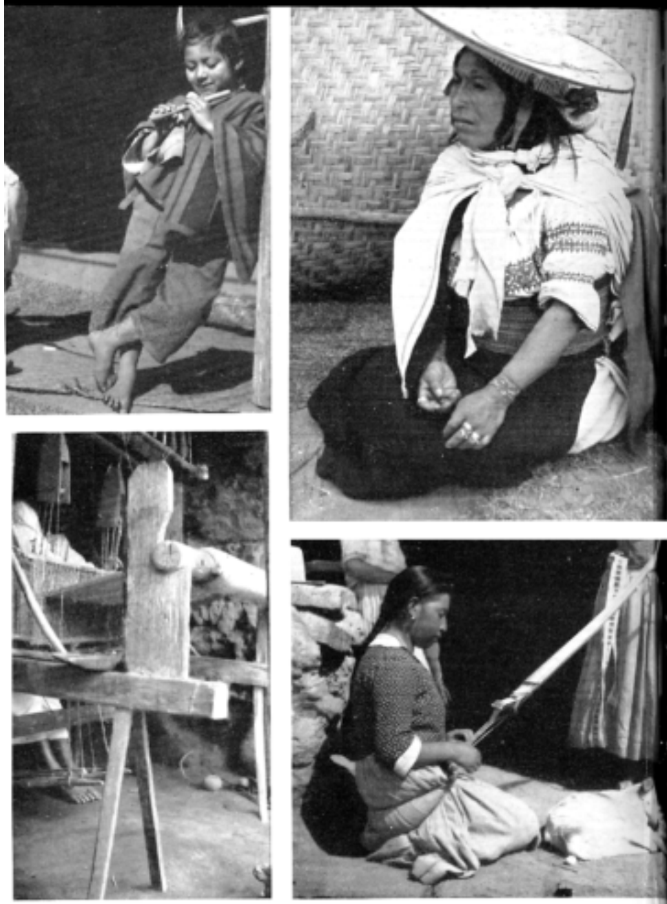
PLATE 162.— Otovalo Indians. Top (left): Children's clothes are a faithful miniature of adult wear. Top (right): Woman at market. Bottom (left): Spanish loom for weaving tweeds for city trade. Bottom (right): An Indian loom. (After Parsons, 1945, pls. 16, 20, 14, and 13.)