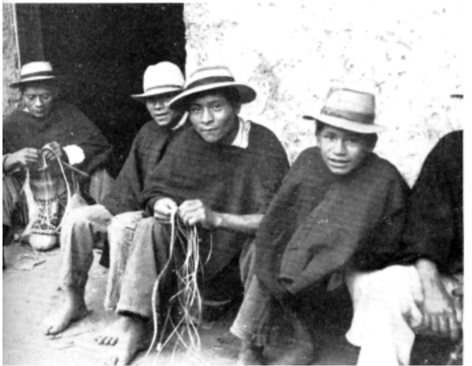
PLATE 187.—Páez weaving and spinning. Top: Woman spinning wool while walking, San Andrés, Tierradentro. Bottom: Men weaving straw hats.