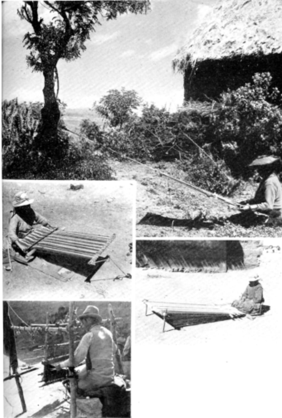
PLATE 97.— Quechua weaving. Top and center (left and right): Native style looms of Peruvian Highlands. Bottom (left): European modifications to the loom. ( Top , courtesy Grace Line; center (left) and bottom (left) , courtesy Truman Bailey; center (right) , courtesy American Museum of Natural History.)