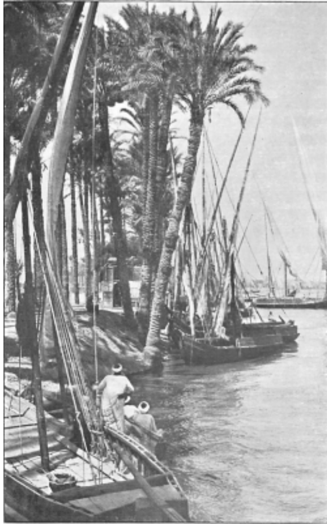
ON THE NILE.