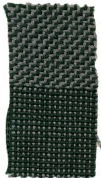
C. Weft 2-24 Alt. Color Twill