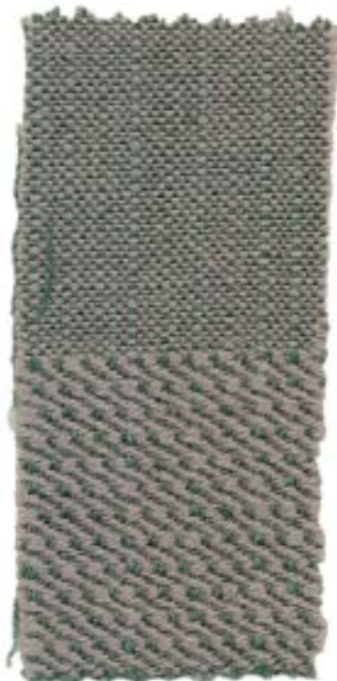
A. Weft 2-18 Tabby