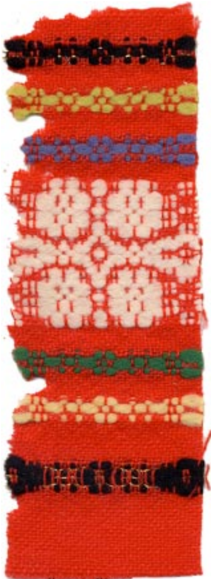
sample stream flosses

Use soft material, bright and gay, Let whim and fancy have their way; Weavers who remember these— Will have the kind of skirts that please.